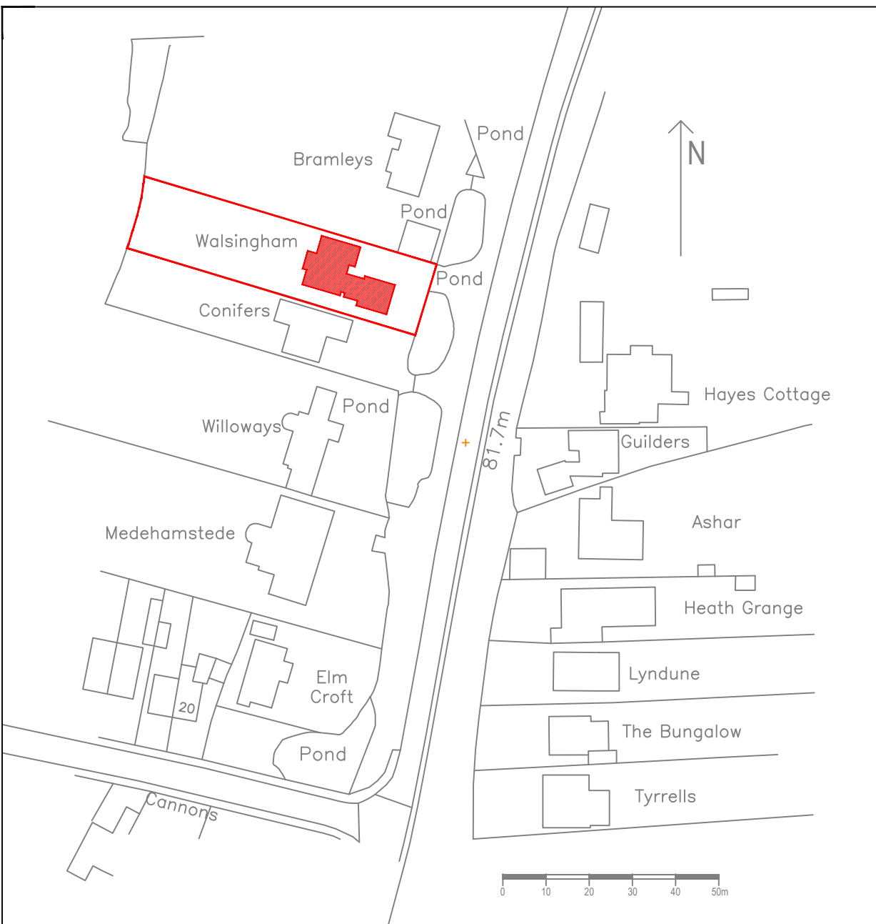
SITE PLAN SCALE 1:1250