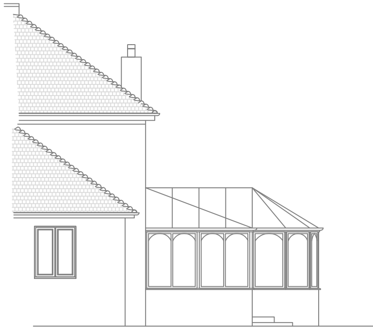
Existing North-West Elevation Scale 1:100