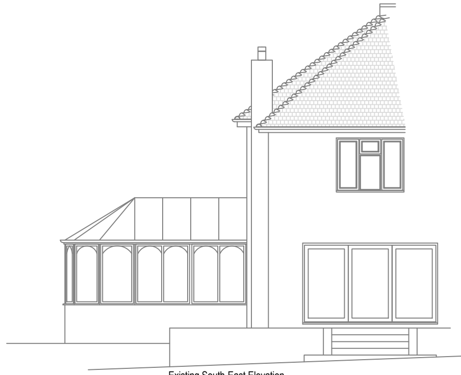
Existing South-East Elevation Scale 1:100