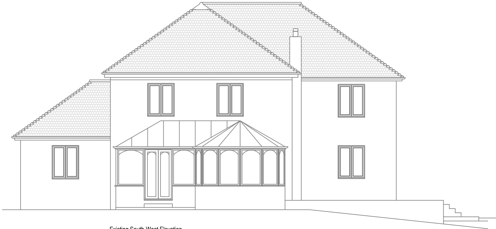
Existing South-West Elevation Scale 1:100