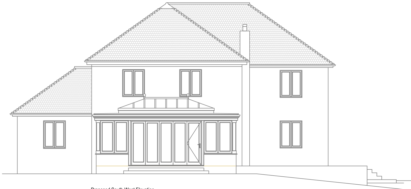
Proposed South-West Elevation Scale 1:100