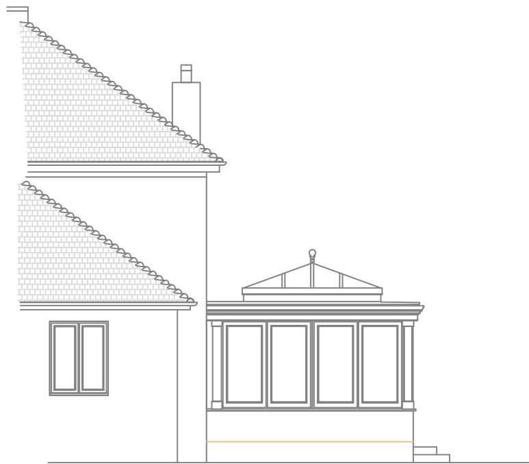
Proposed North-West Elevation Scale 1:100