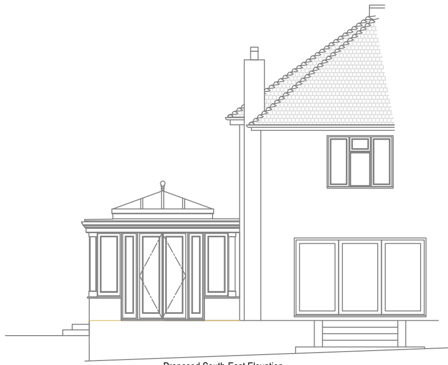
Proposed South-East Elevation Scale 1:100