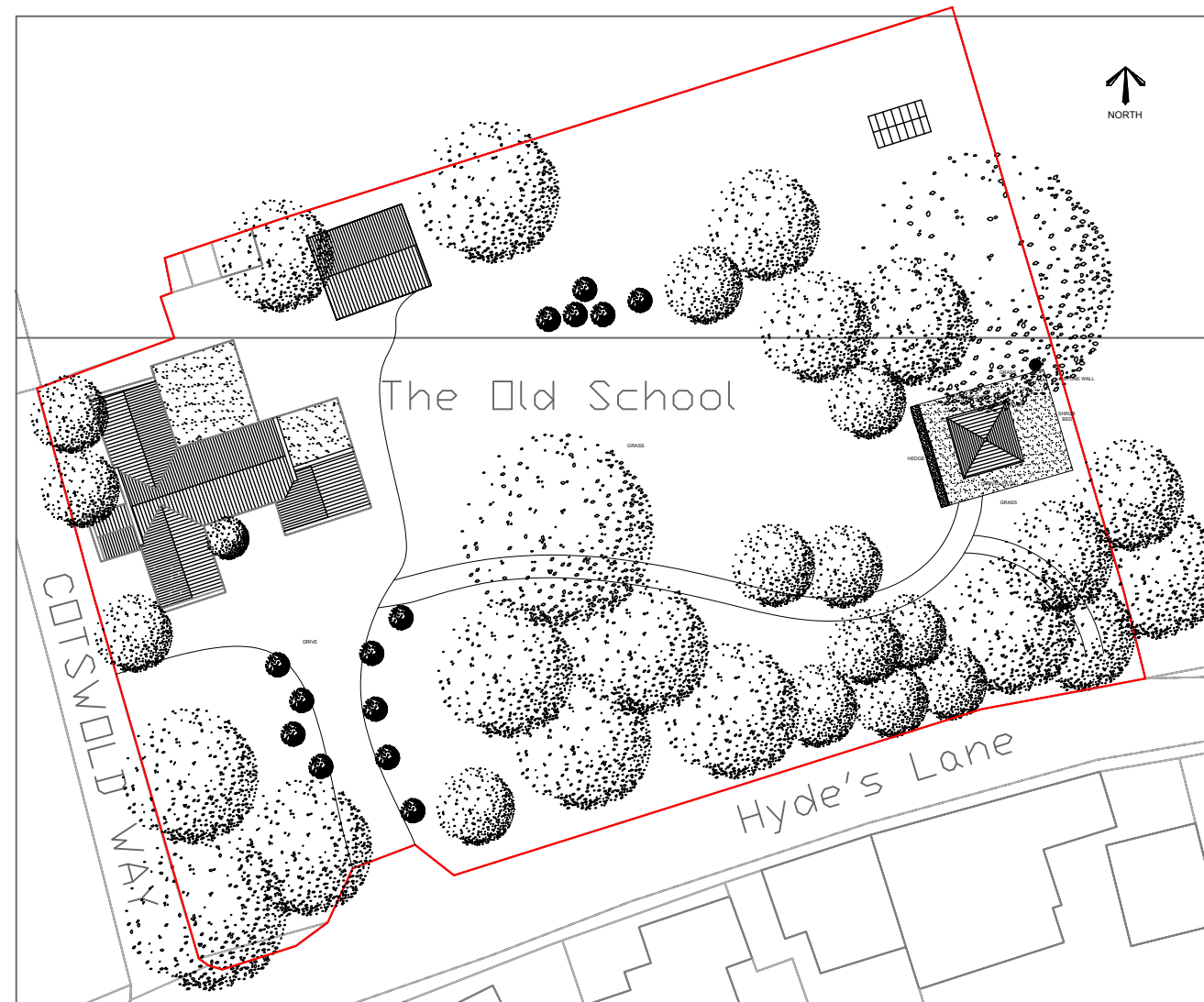
EXISTING SITE PLAN @ 1:500