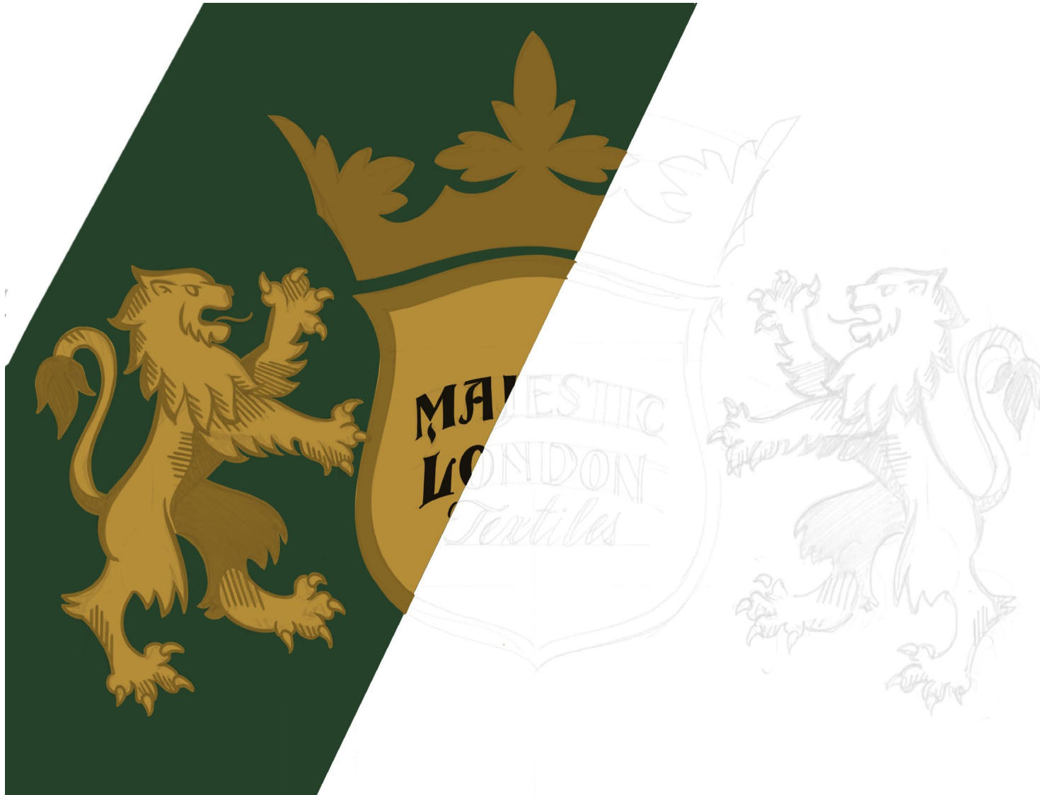
CORNER FASCIA DESGIN