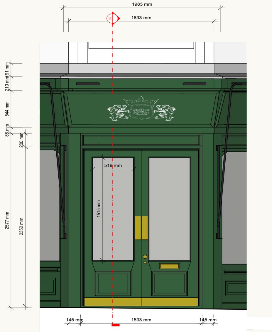
01 Proposed Shop Front Elevation Scale: 1:25