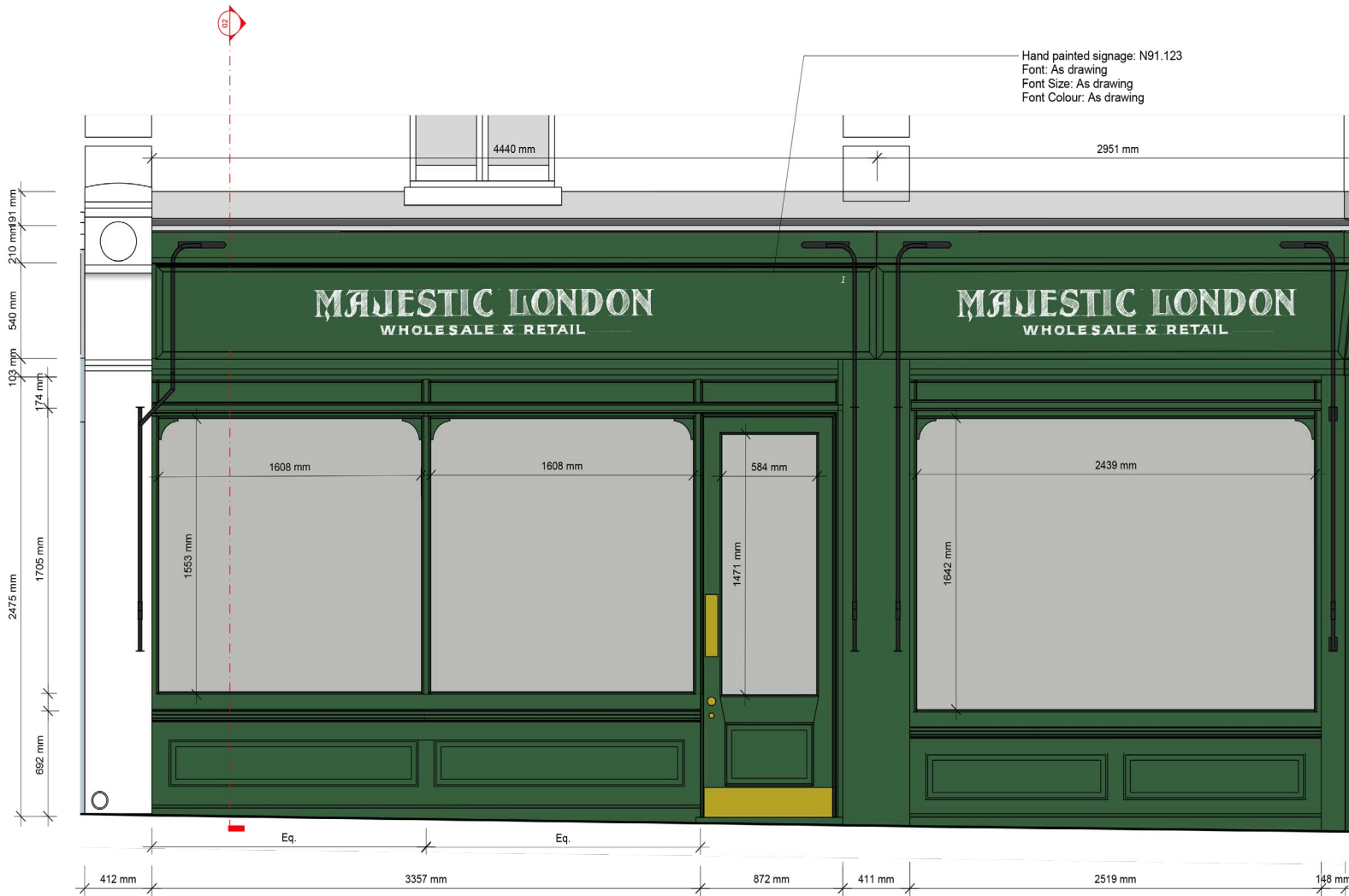
01 Proposed Shop Front Elevation Scale: 1:25