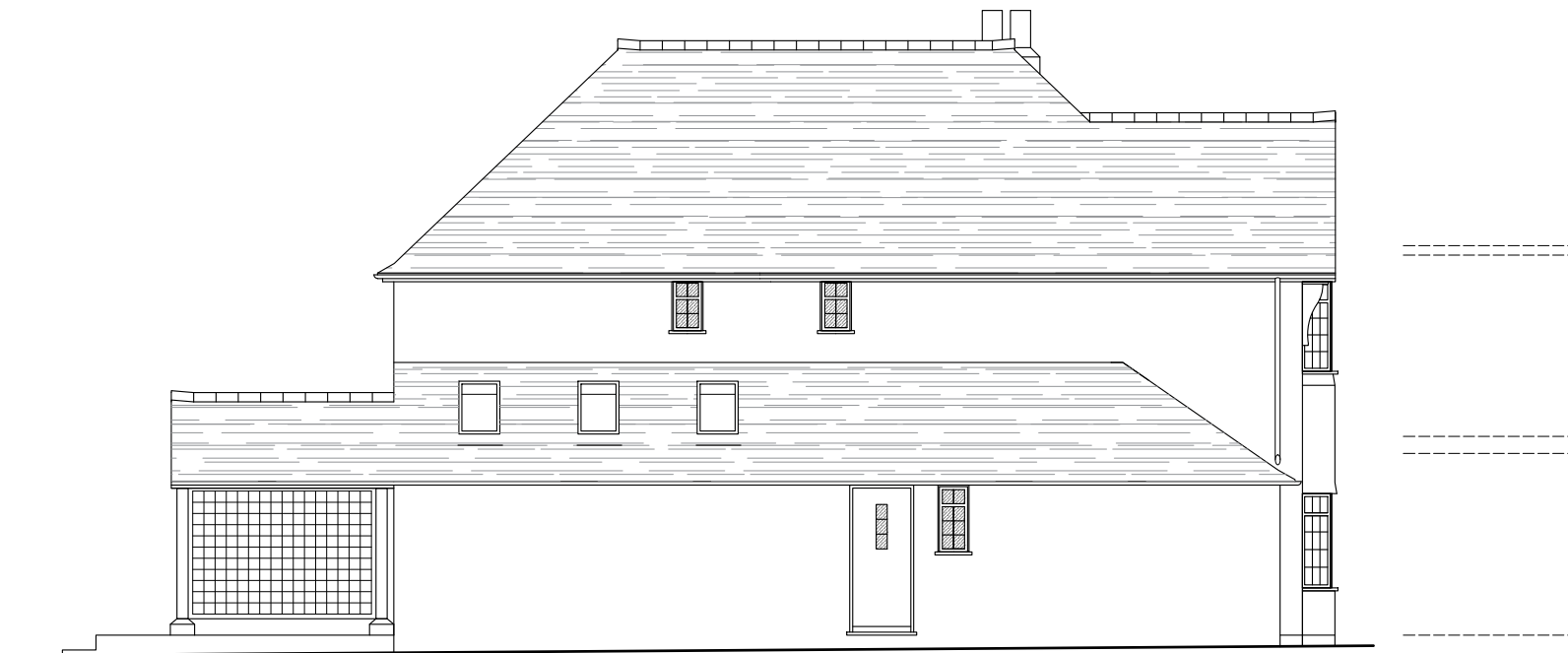
PROPOSED: SIDE - NORTH-WEST ELEVATION

PROPOSED MATERIALS: Walls: Render and hanging tile to match existing Roofs: Clay tile to match existing; grey grp (dormer window); glazed rooflights to En-suite & Kitchen (fitted with black-out blinds for use in hours of darkness) Windows & Doors: Aluminium casements to match existing (En-suite & Utility windows obscure-glazed and non-opening within 1.7m of floor level)