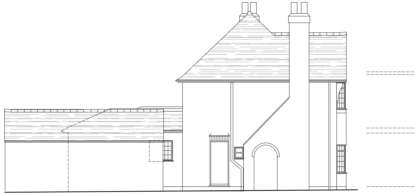
EXISTING: SIDE - NORTH-WEST ELEVATION