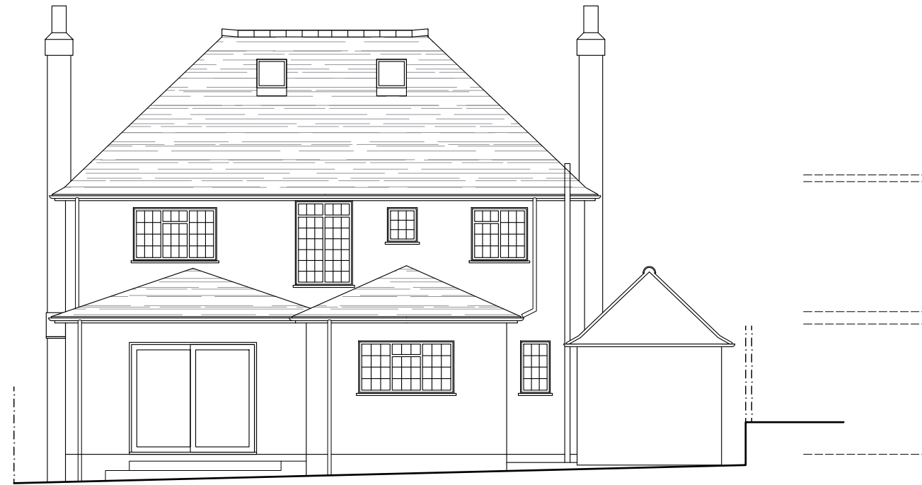
EXISTING: REAR ELEVATION