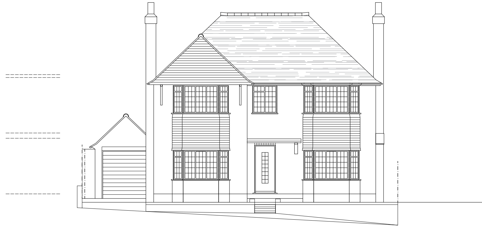
EXISTING: FRONT - SOUTH-WEST ELEVATION