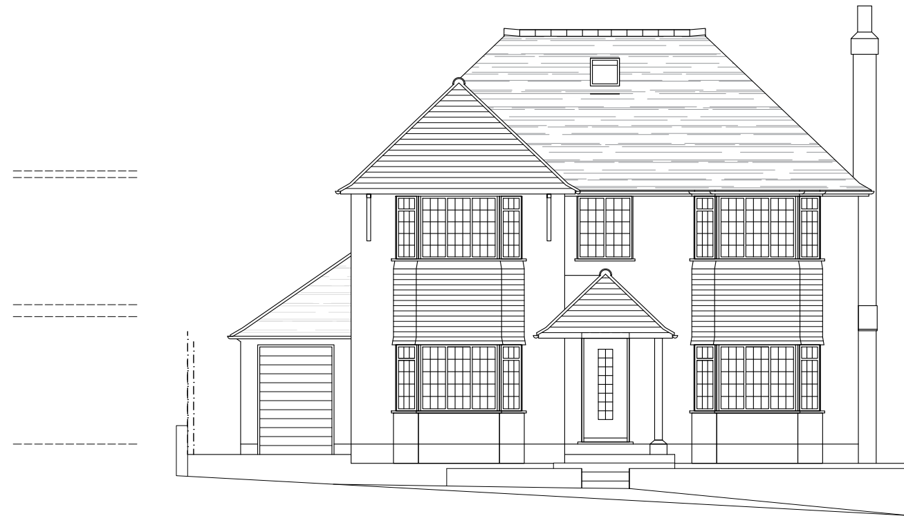
PROPOSED: FRONT - SOUTH-WEST ELEVATION

PROPOSED MATERIALS: Walls: Render and hanging tile to match existing Roofs: Clay tile to match existing; glazed rooflight