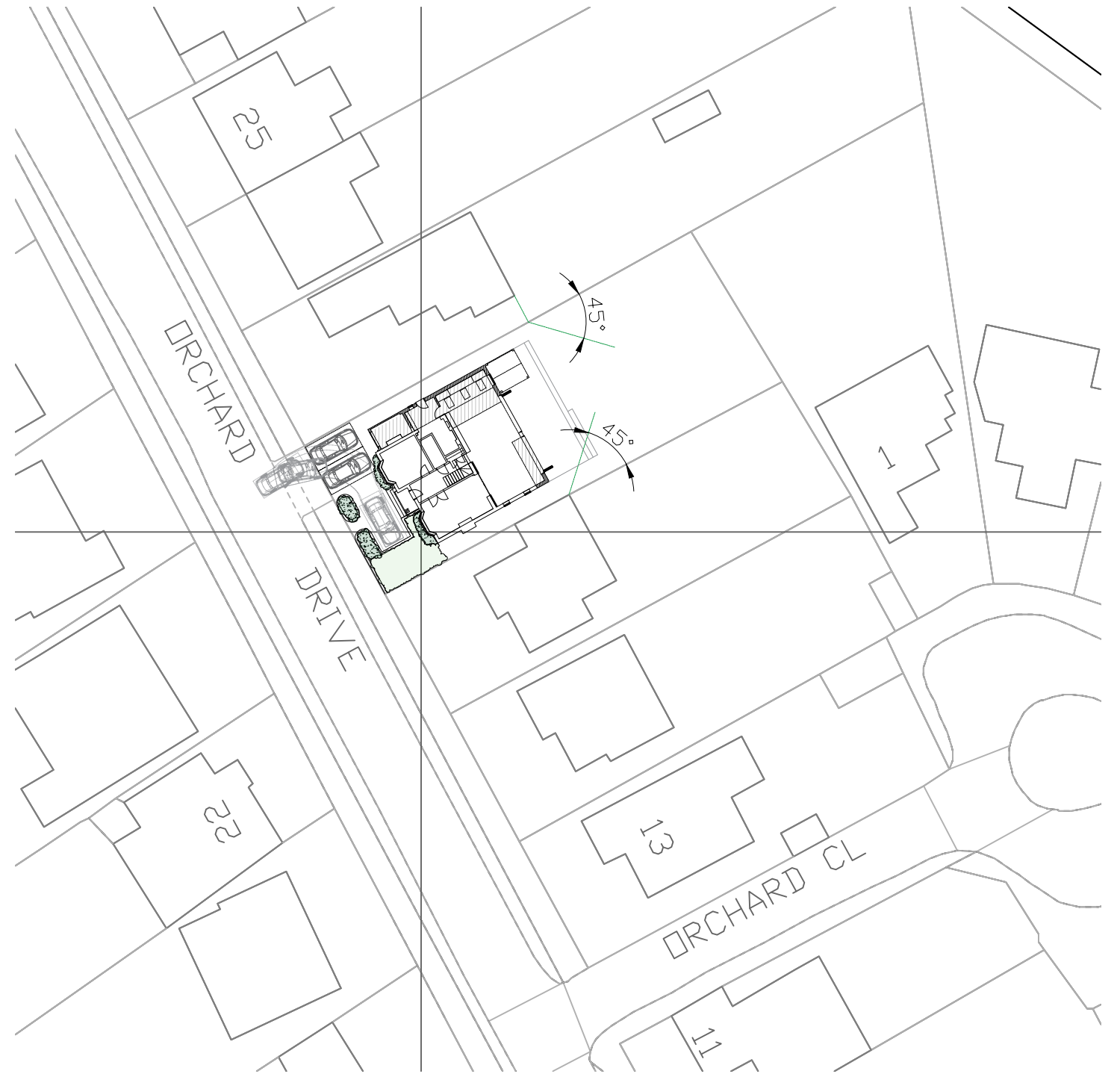
PROPOSED GROUND FLOOR BLOCK PLAN