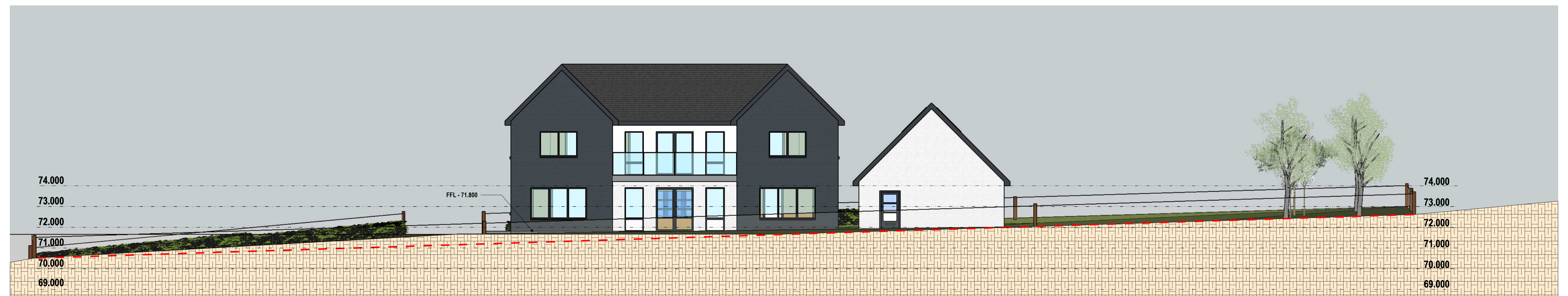
CROSS SECTION C:C / SOUTH ELEVATION 1:100