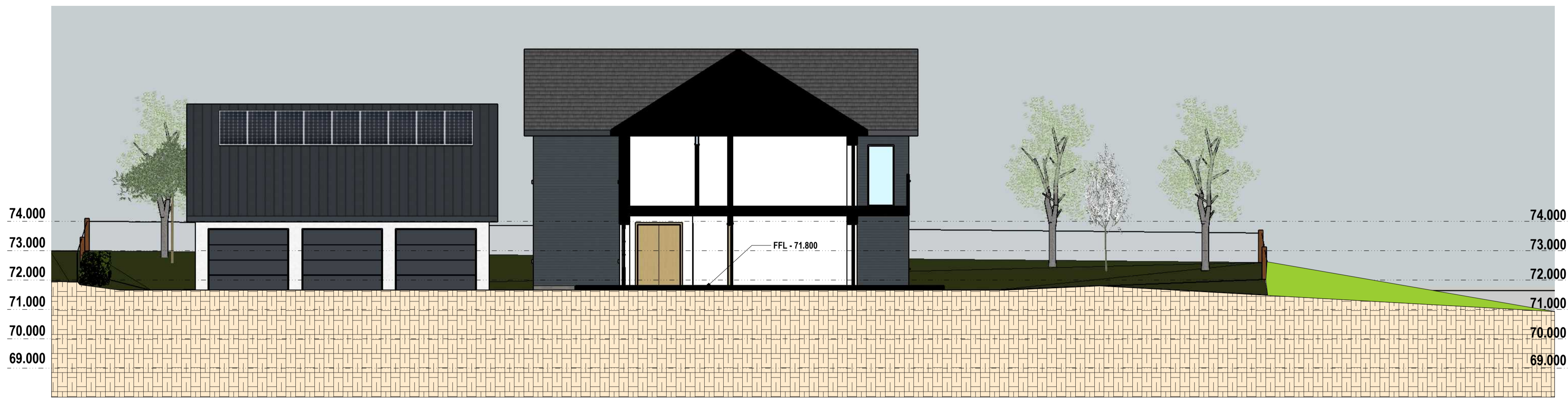
INTERNAL EAST FACING SECTIONAL ELEVATION / CROSS SECTION A:A 1:100

--- DENOTES EXISTING GROUND LEVELS ——— DENOTES PROPOSED AND UNCHANGED GROUND LEVELS