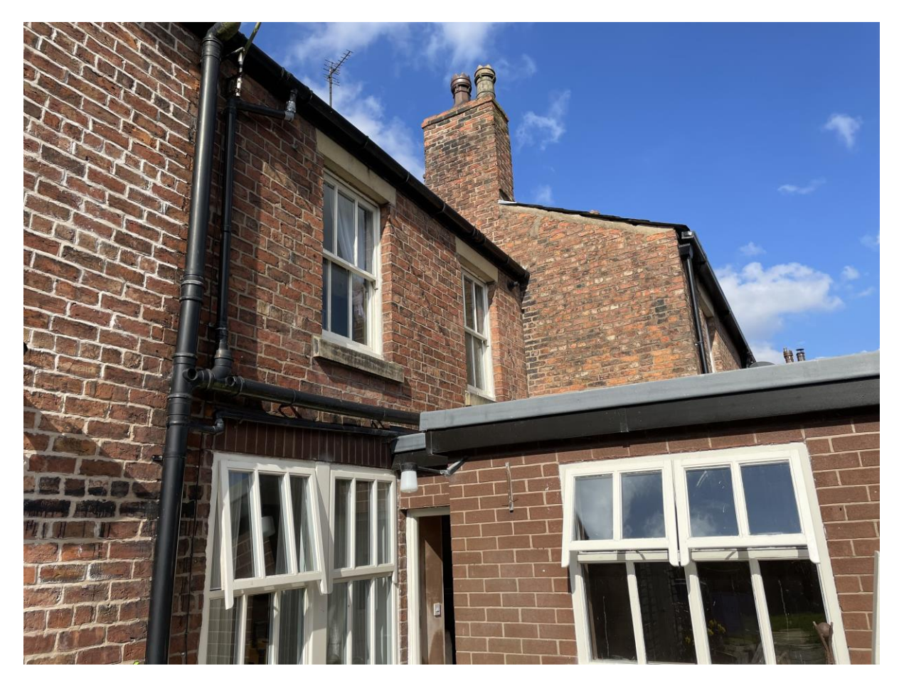
Fig 2 – WG03, WG04, WF02, WF03