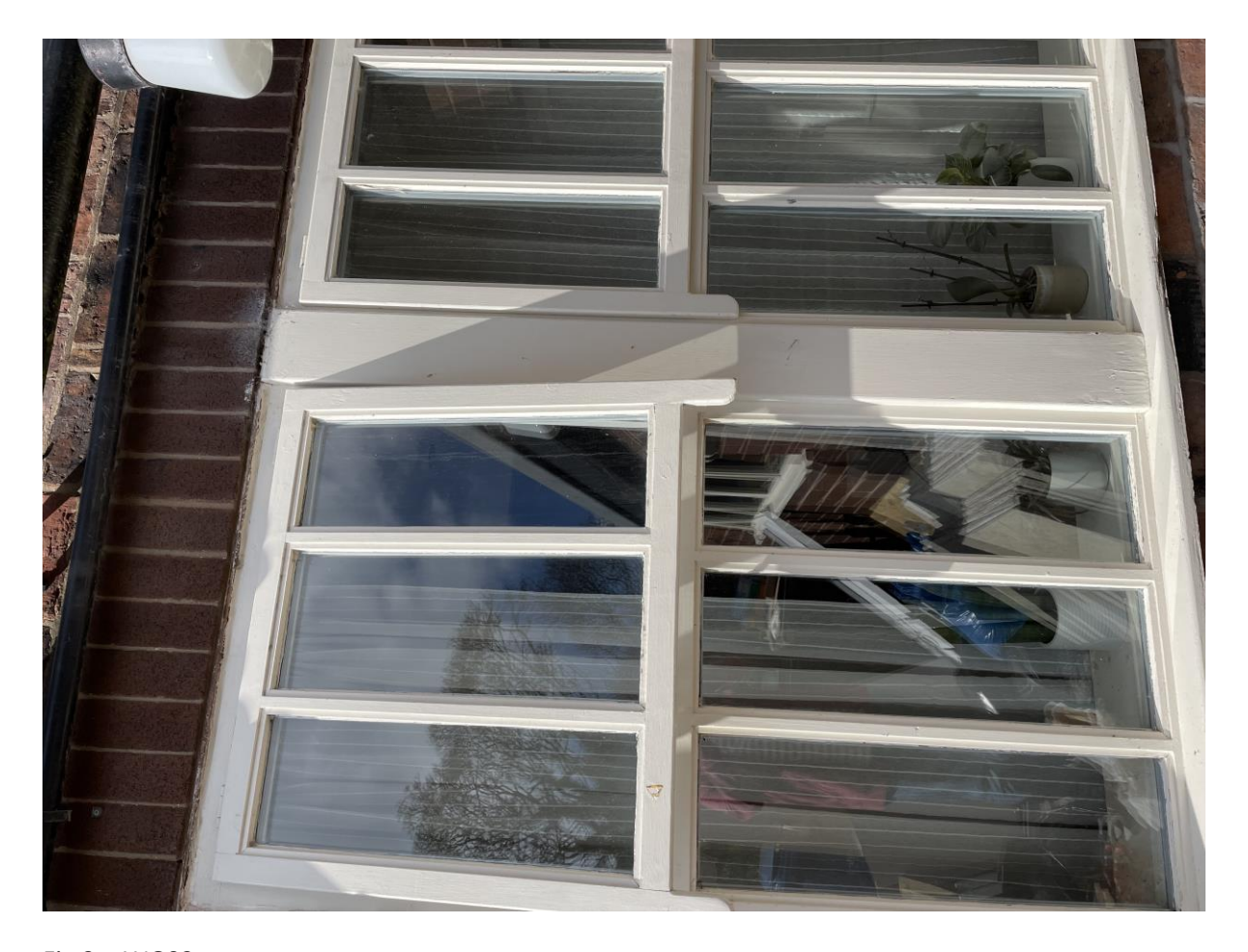
Fig 3 – WG03