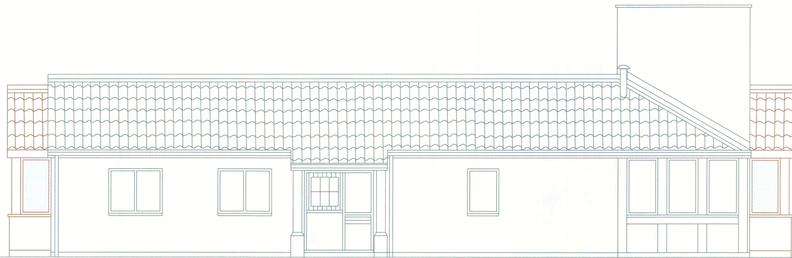
front elevation note: new external materials to match the existing