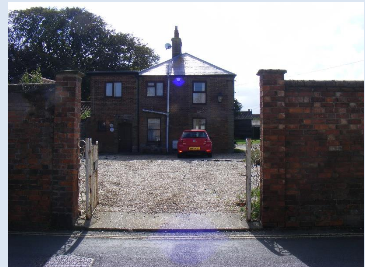
Existing site access to be altered, with improved visibility splays