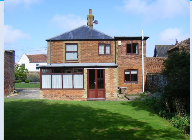
Rear of existing building