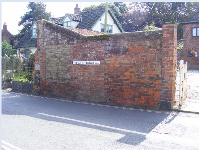
Section of wall inside conservation area