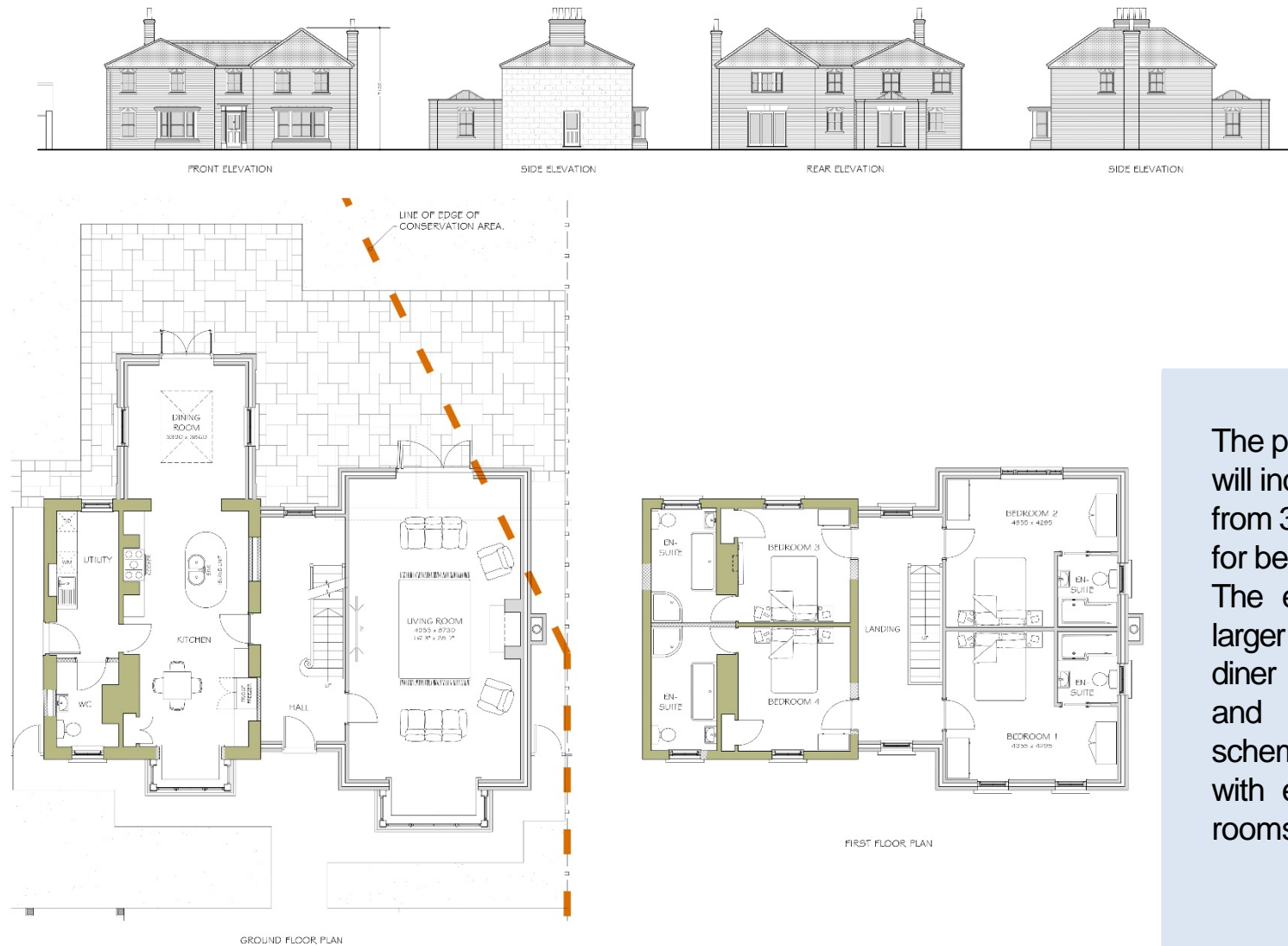
Proposed floor plans and elevations for existing dwelling

The proposed extension to The Nurseries will increase the number of bedrooms from 3 to 4 and the new layout will allow for better disabled access.