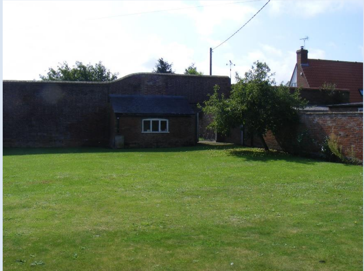
Rear of site

Although the site is partially inside the Wells-Next-the-Sea Conservation Area, the scheme will allow a visually appealing design that does not conflict with the surrounding area.