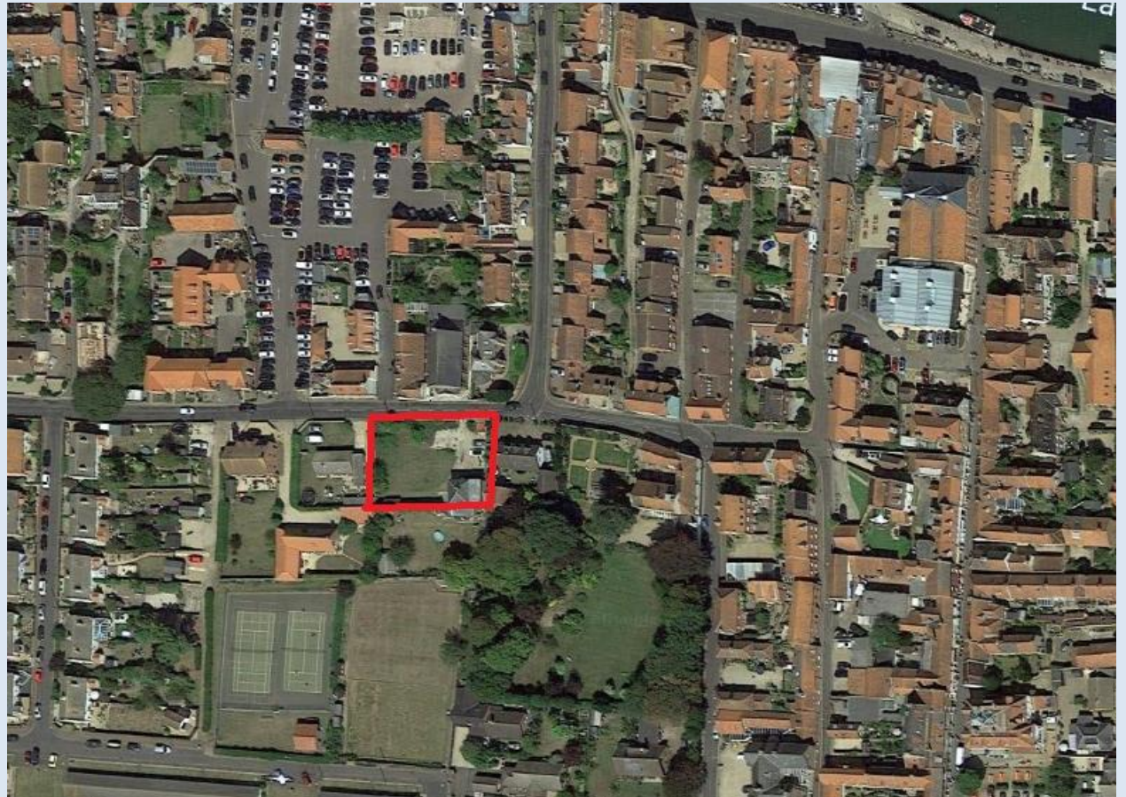
The proposed site on Theatre Road

All documents referenced in this statement will be made available separately.