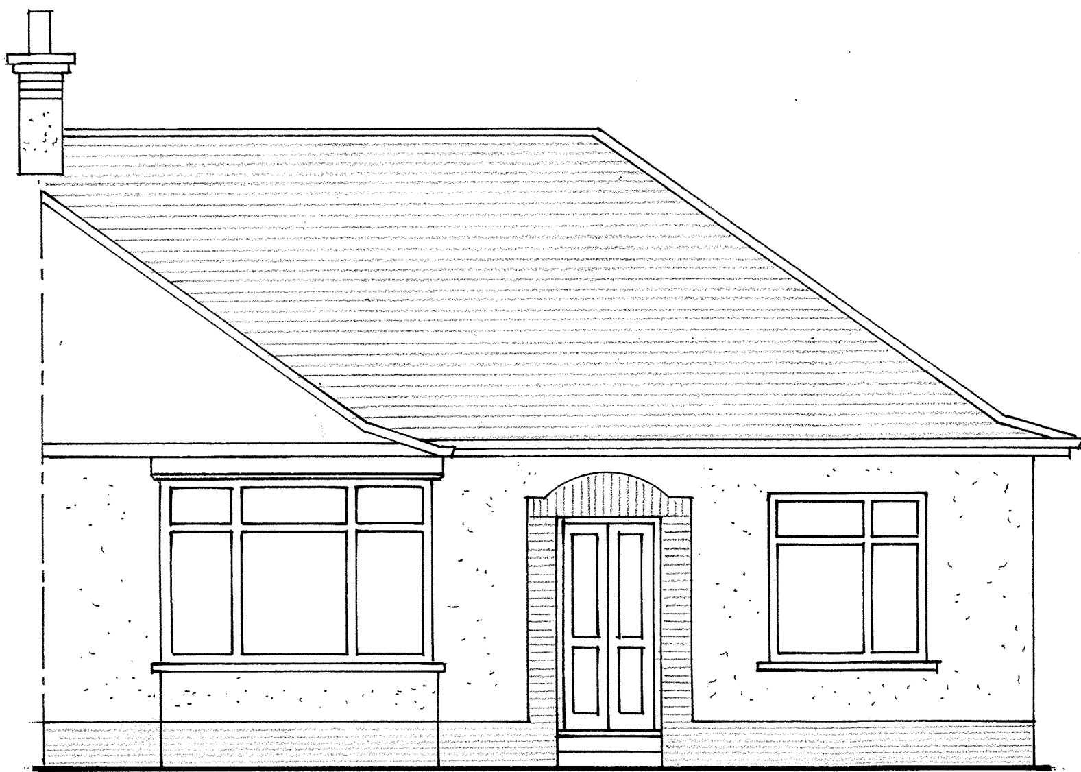
FRONT ELEVATION AS EXISTING