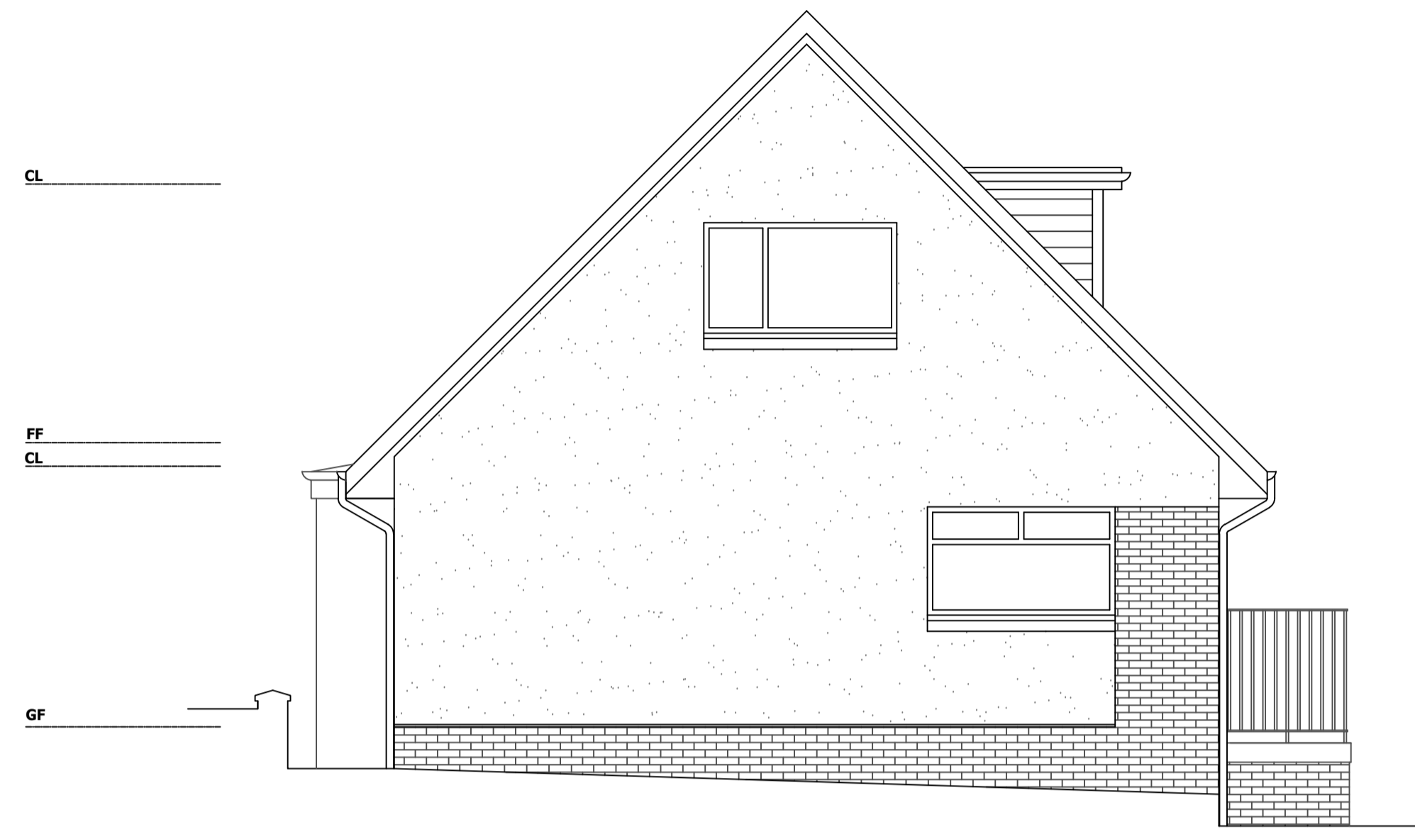
EAST GABLE ELEVATION AS EXISTING