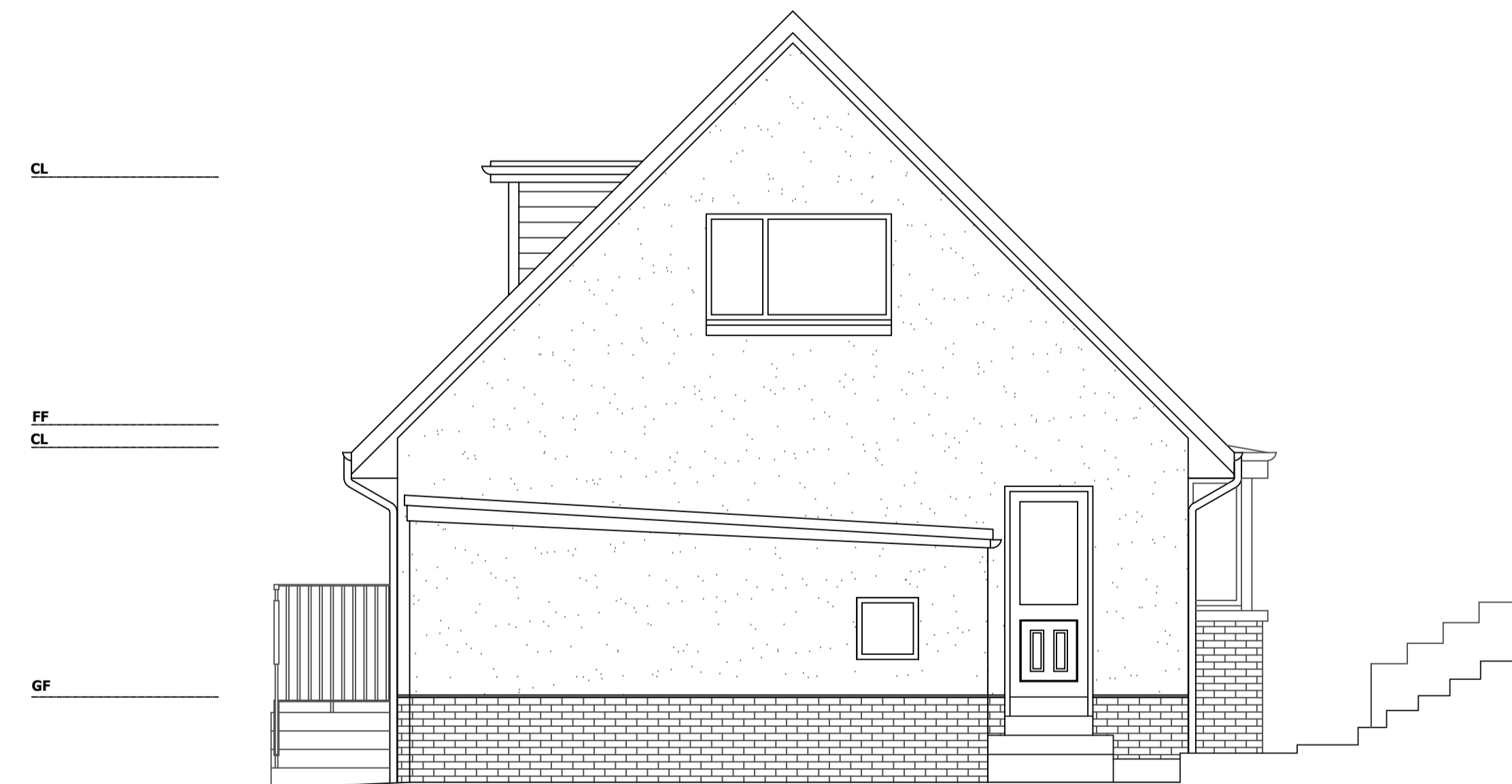
WEST GABLE ELEVATION AS EXISTING