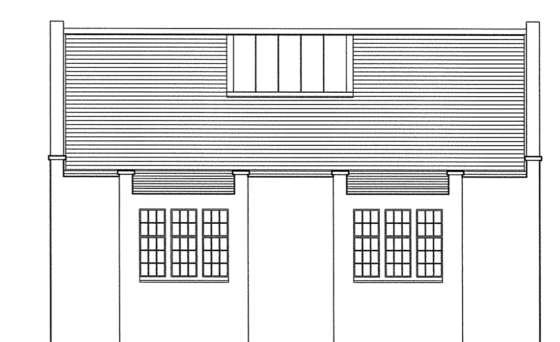
East Elevation as Existing