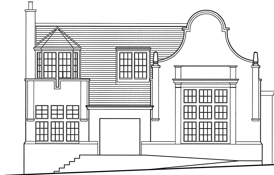
West Elevation as Existing