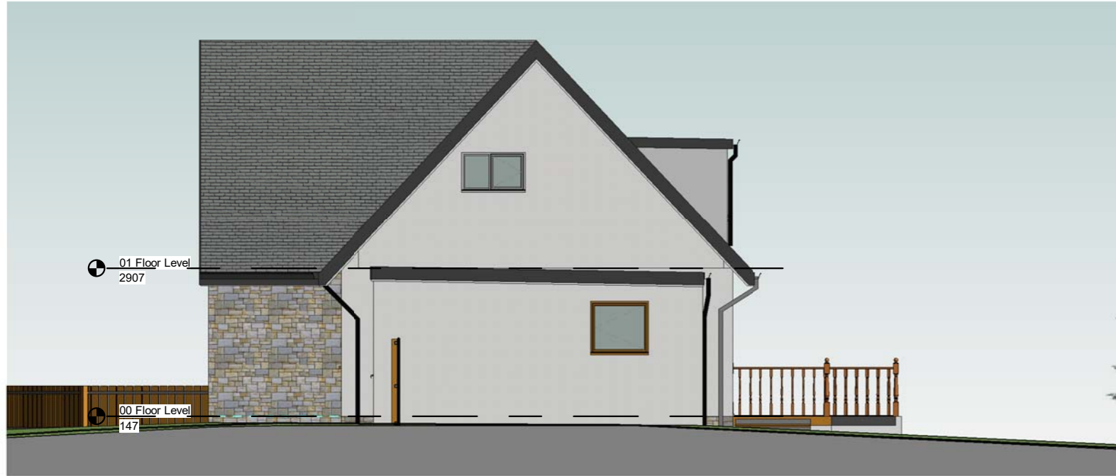
3 Existing Side Elevation (LHS) 1: 100