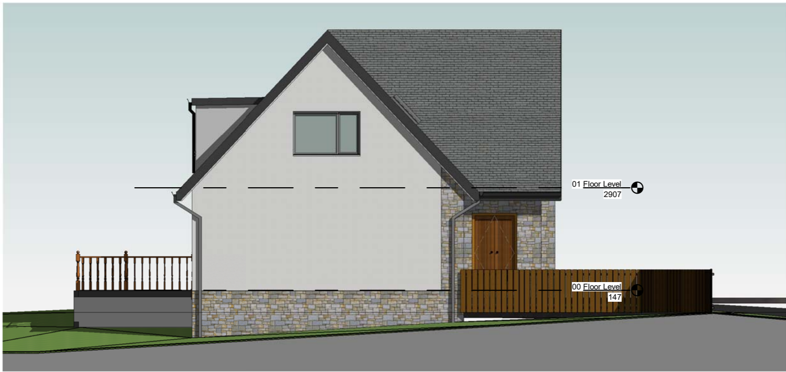
4 Existing Side Elevation (RHS) 1: 100