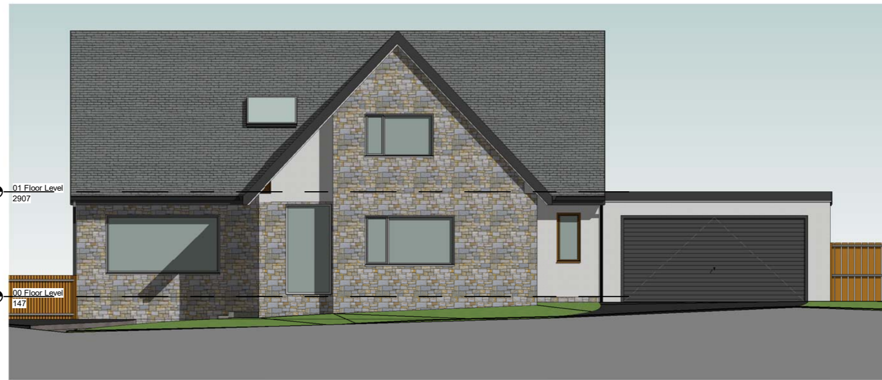
1 Existing Front Elevation 1: 100