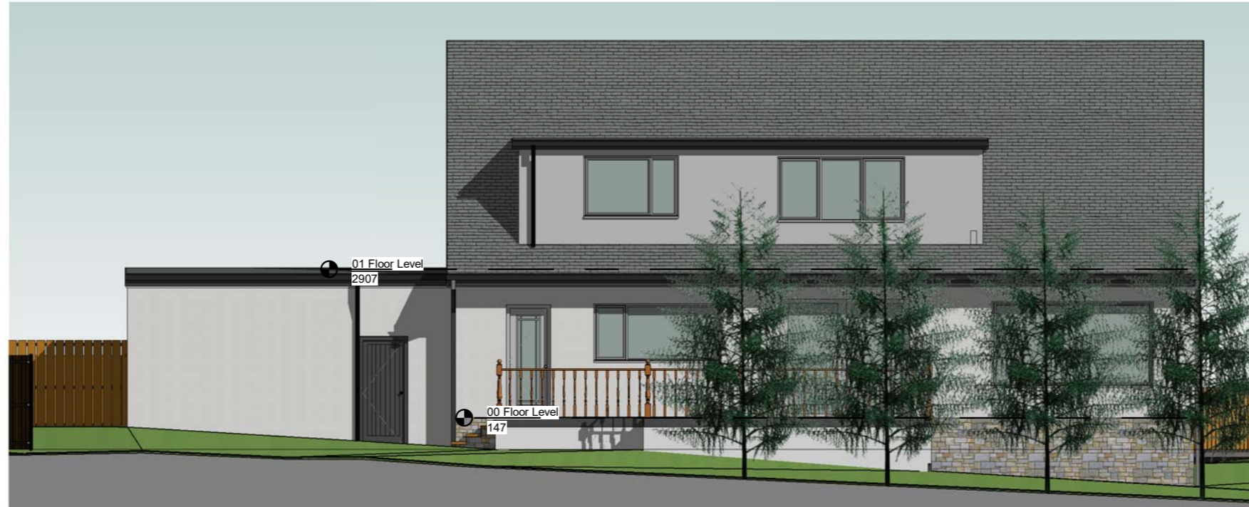
2 Existing Rear Elevation 1: 100