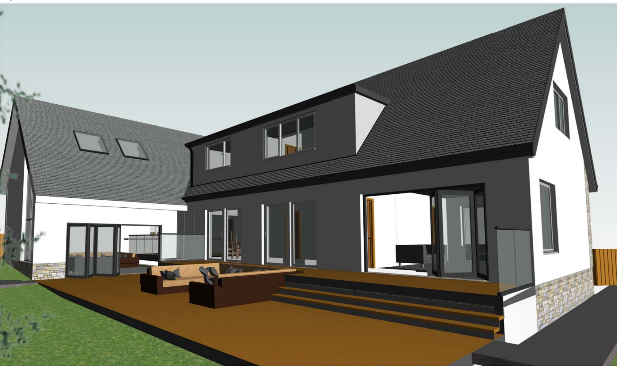
6 3D View 1