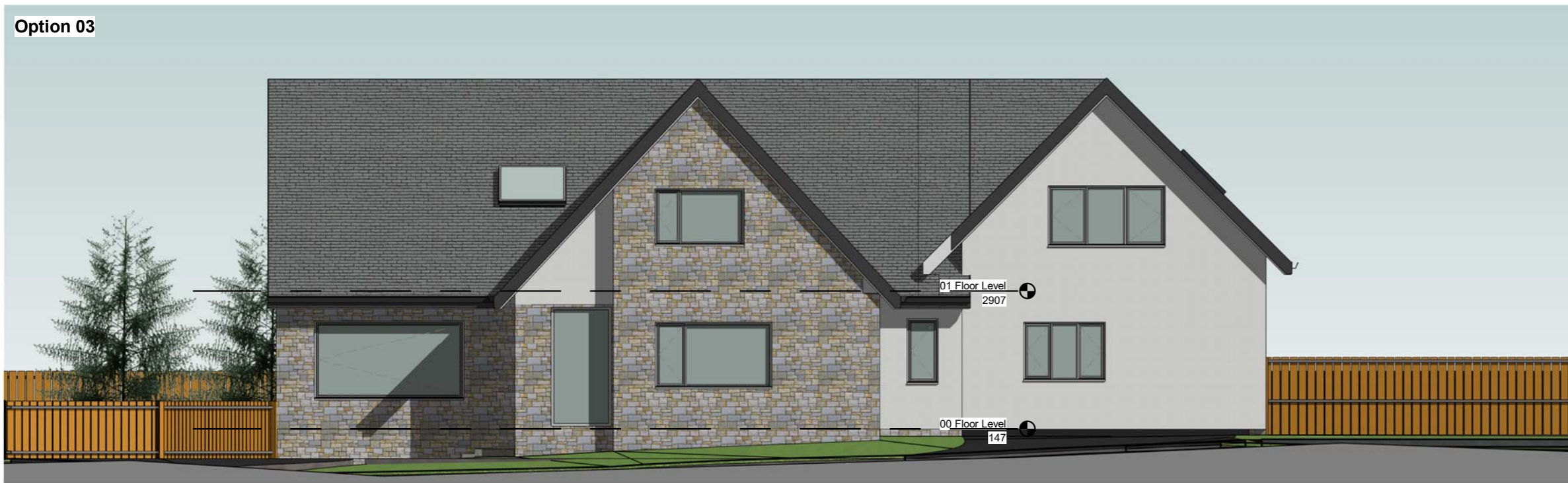
1 Proposed Front Elevation 1 : 100