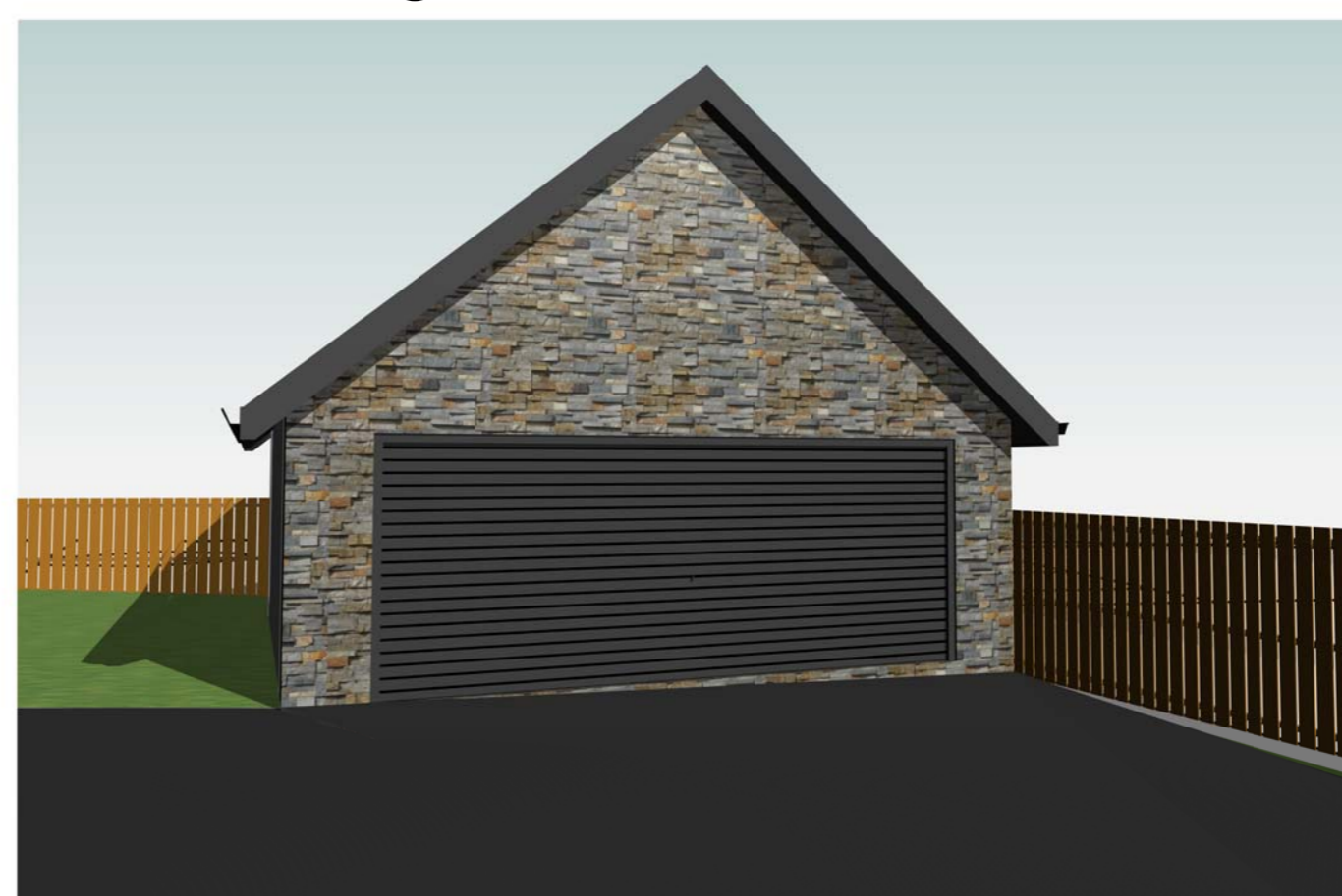
5 3D View 2