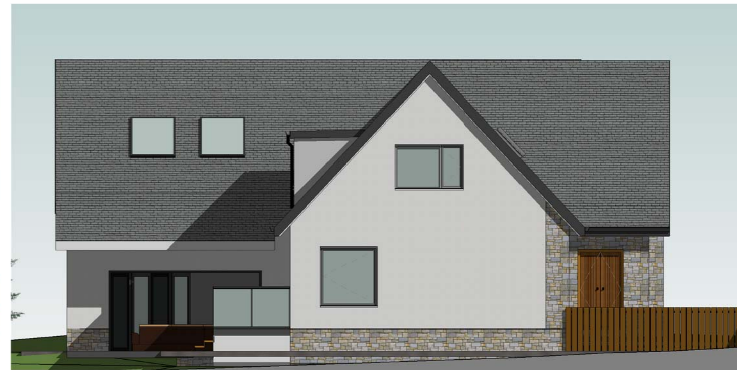
4 Proposed Side Elevation (RHS) 1 : 100