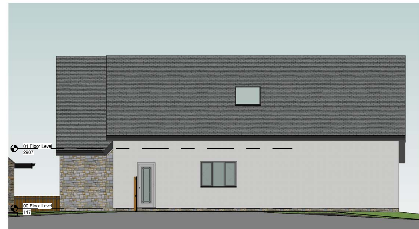
3 Proposed Side Elevation (LHS) 1 : 100