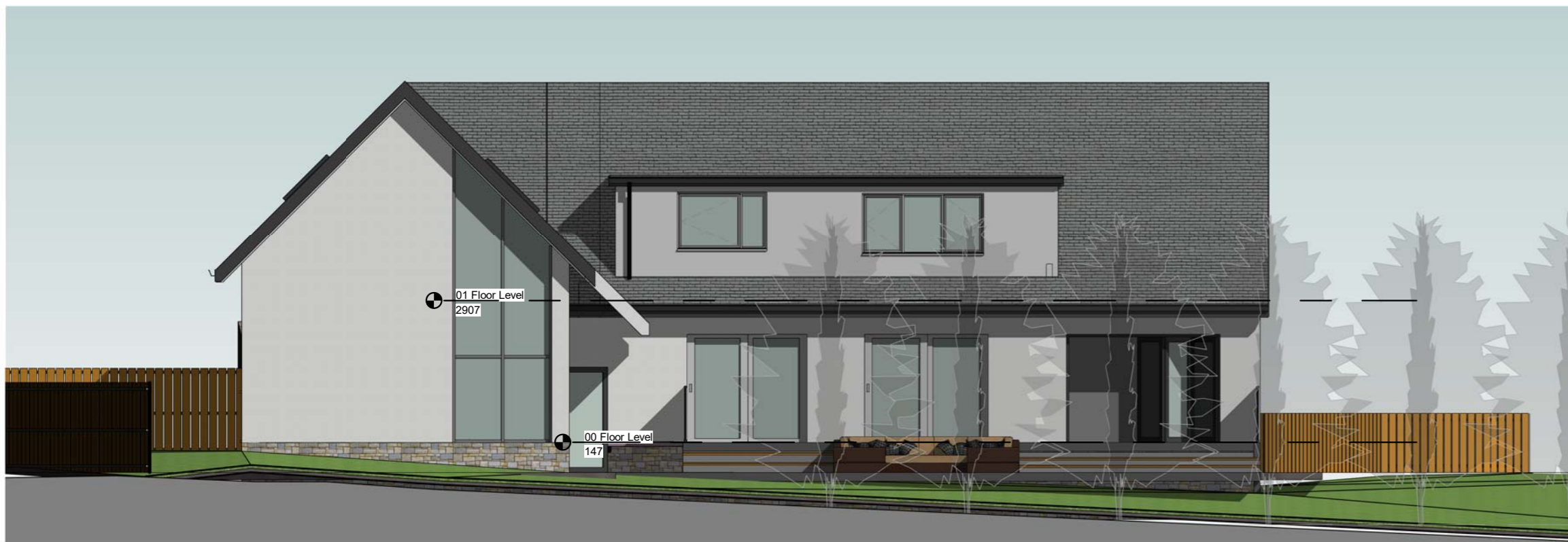
2 Proposed Rear Elevation 1 : 100