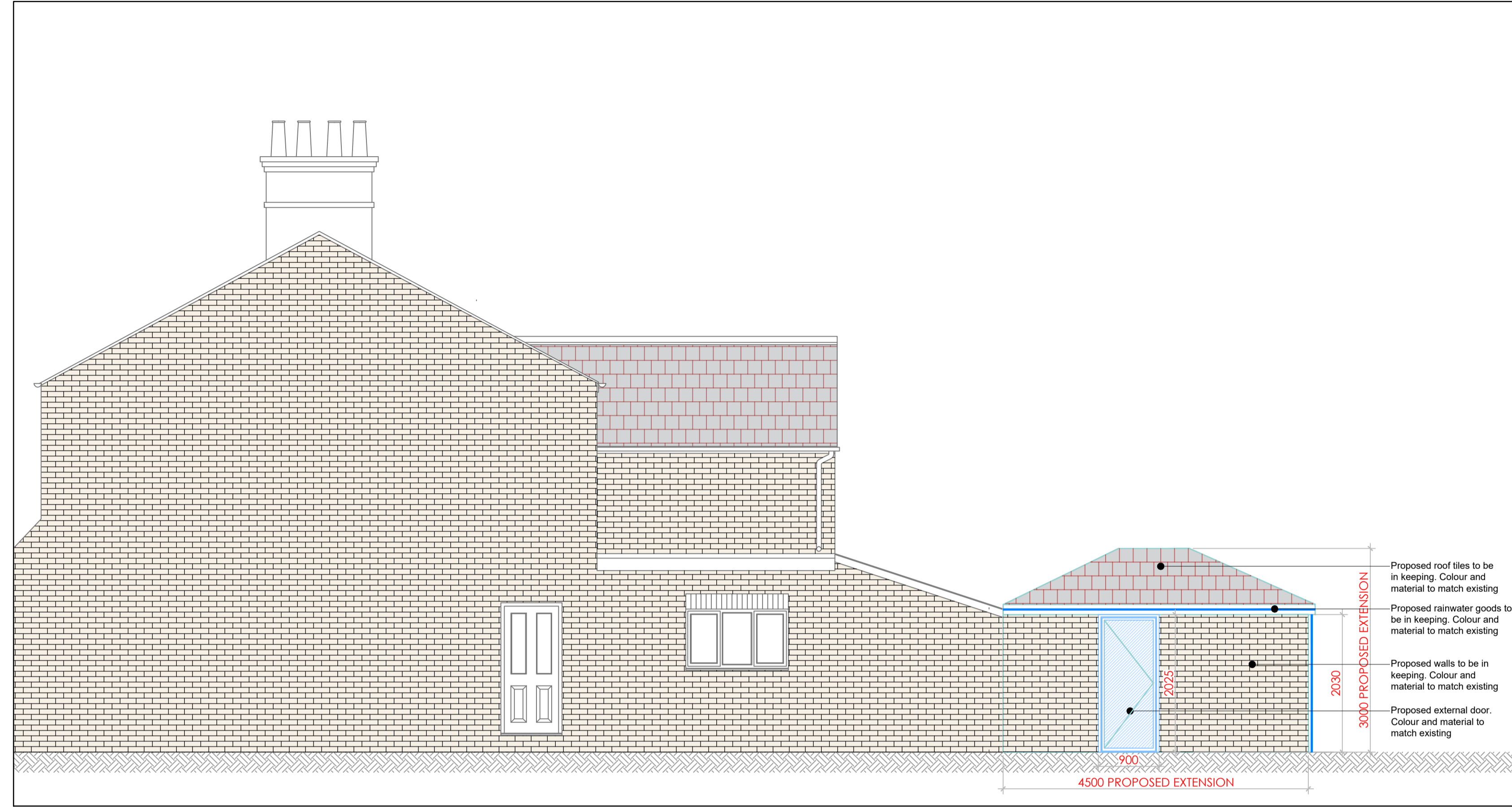
PROPOSED SIDE ELEVATION - SCALE 1:50