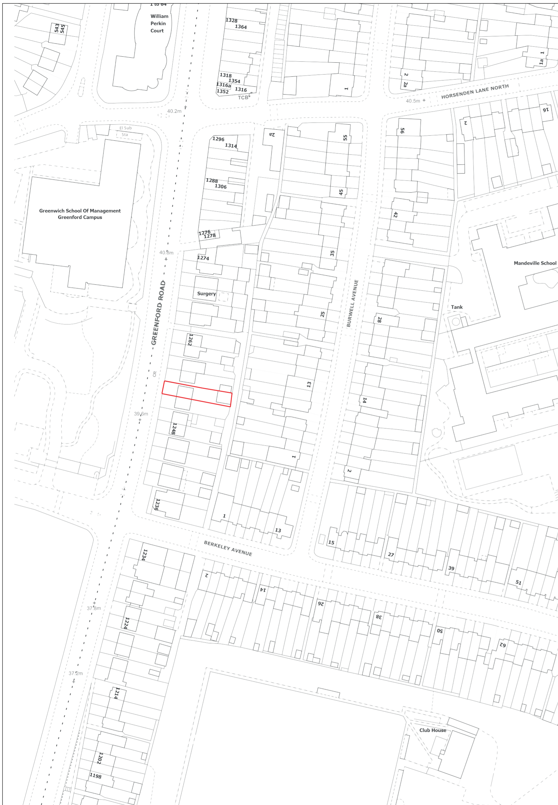
SITE LOCATION PLAN SCALE 1:1250 SITE BOUNDARY :