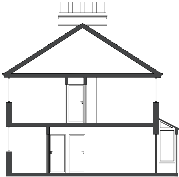
EXISTING SECTION 1:100