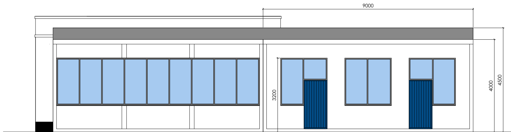
Proposed Left Elevation (1:100)