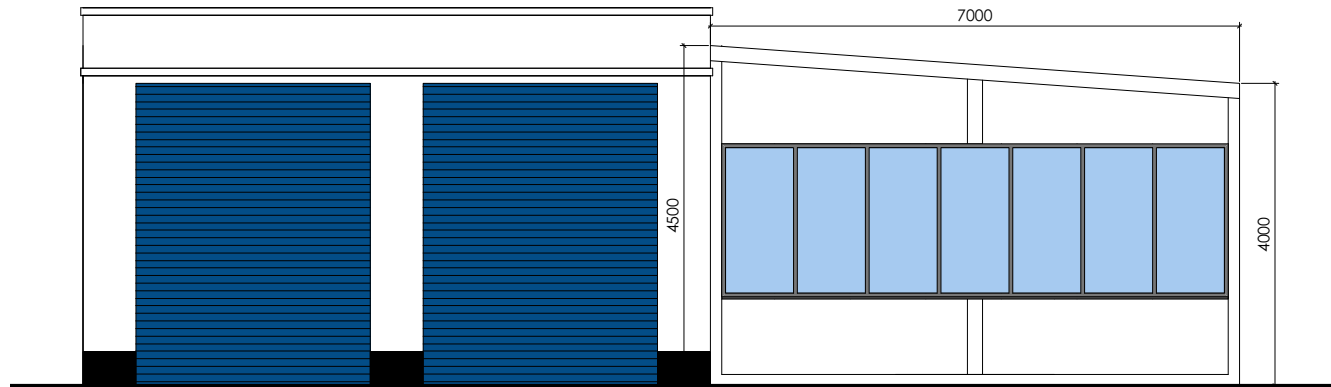
Proposed Rear Elevation (1:100)