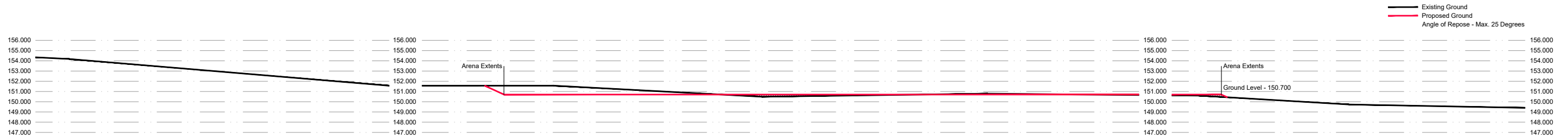
Proposed Site Section A-A