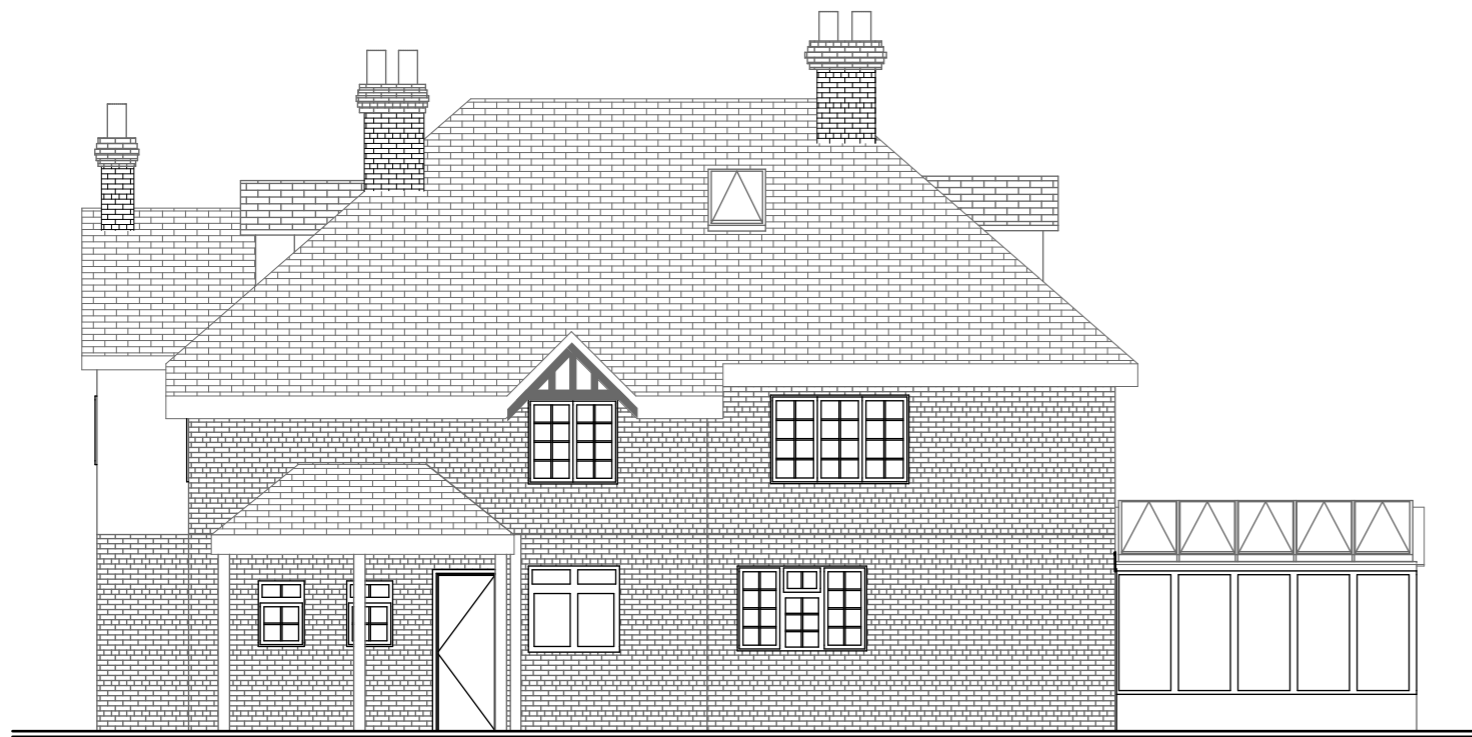
3 East Elevation 1:100