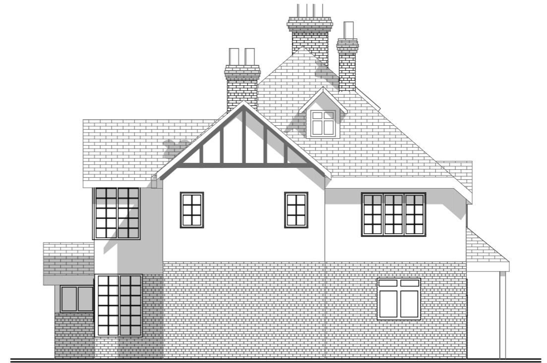
2 South Elevation 1:100