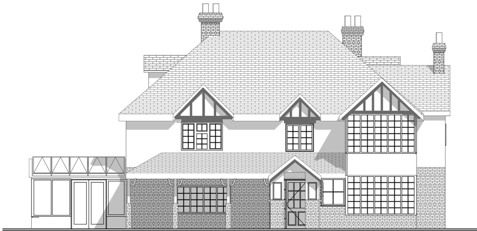
1 West Elevation 1:100