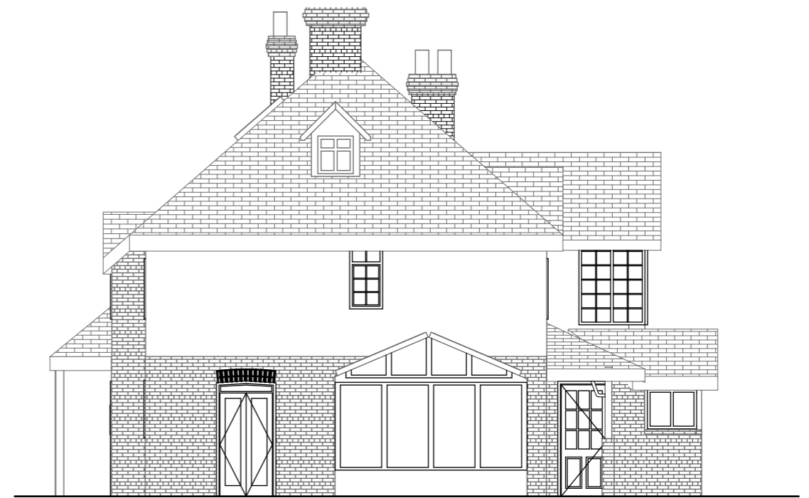
4 North Elevation 1:100