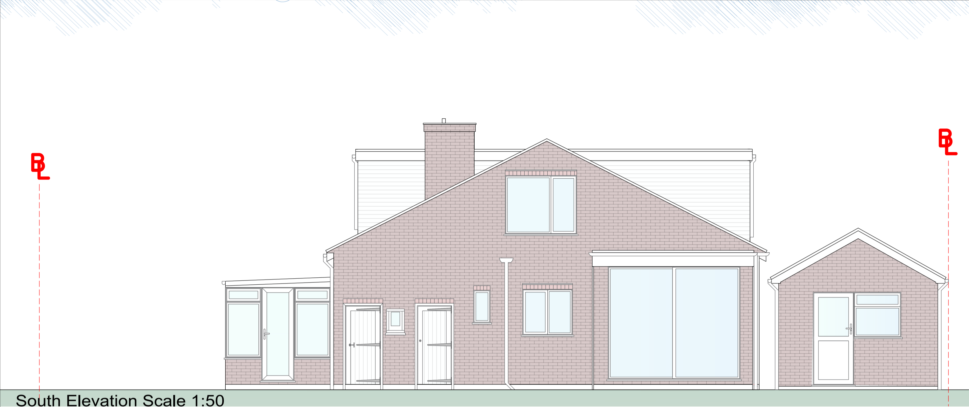
South Elevation Scale 1:50