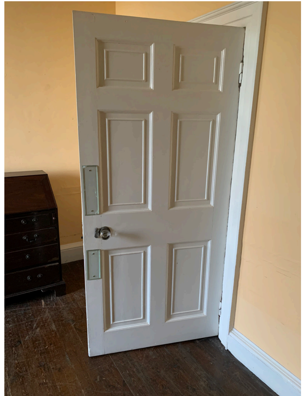
EXISTING DOOR FOR DINING ROOM G05