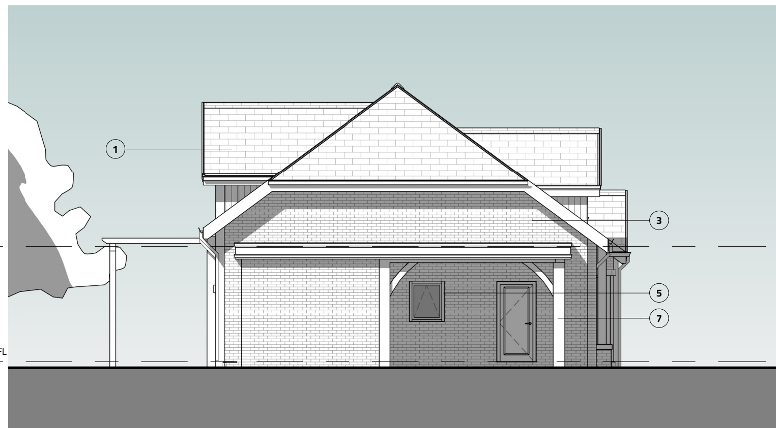
East - Proposed 1 : 100

8 Brooks Street, Stockport. SK1 3HS 0161 474 6860 | hello@buju.co.uk | www.buju.co.uk