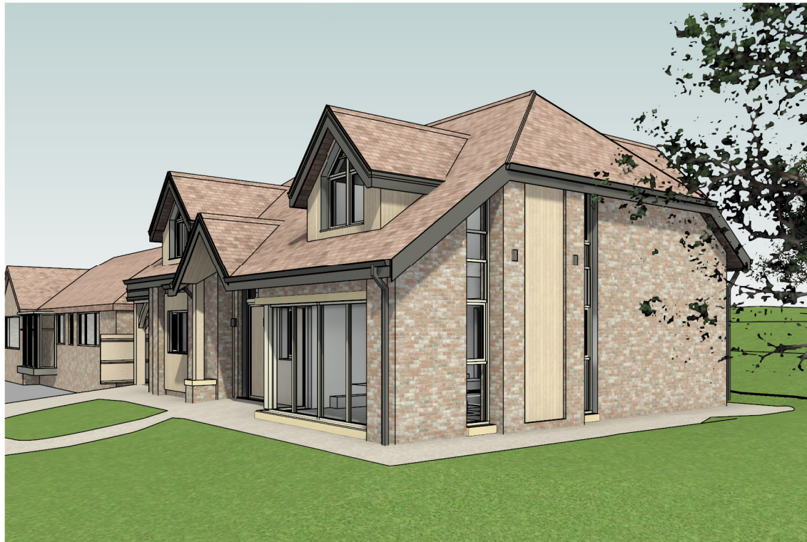
3D Perspective - Side