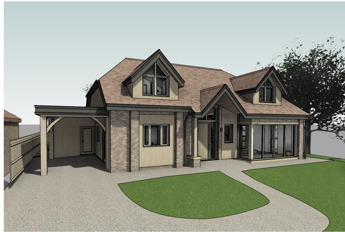
3D Perspective - Front