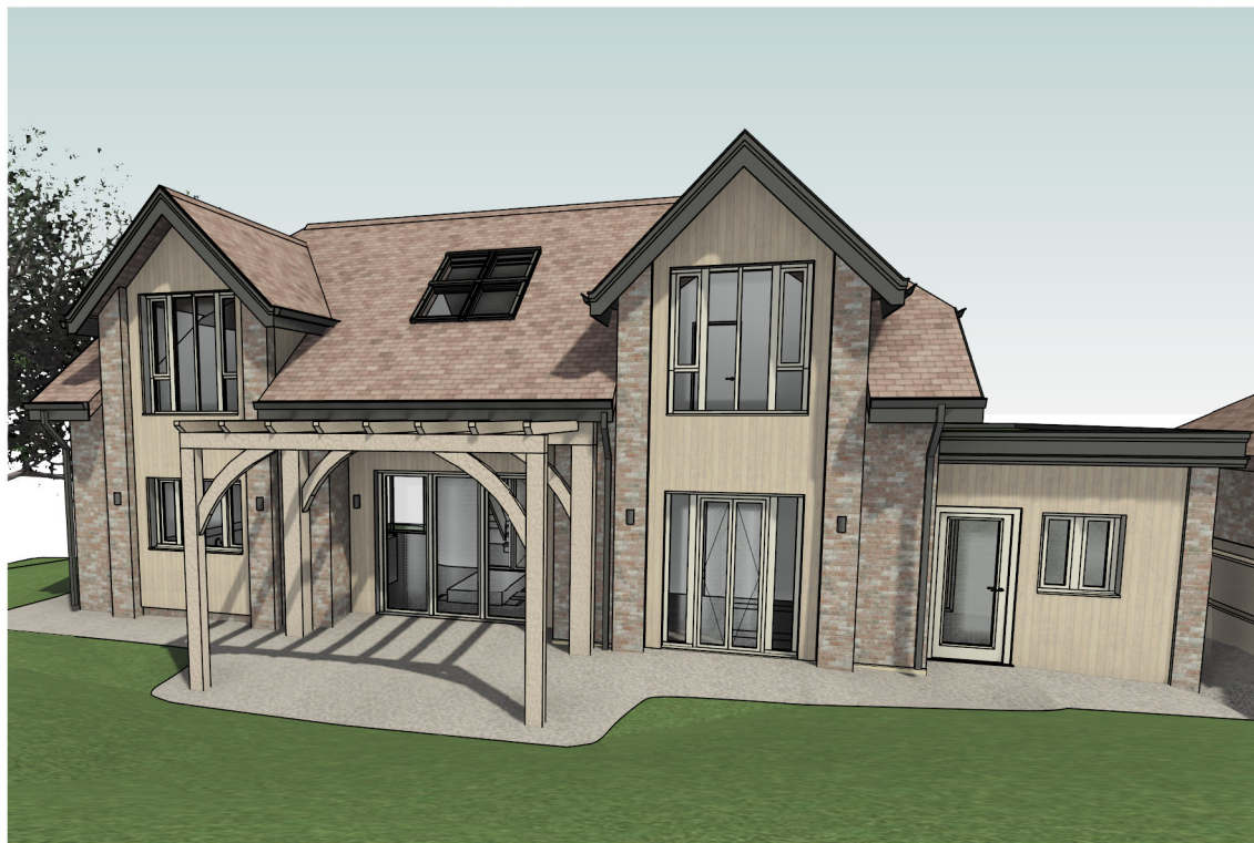
3D Perspective - Rear