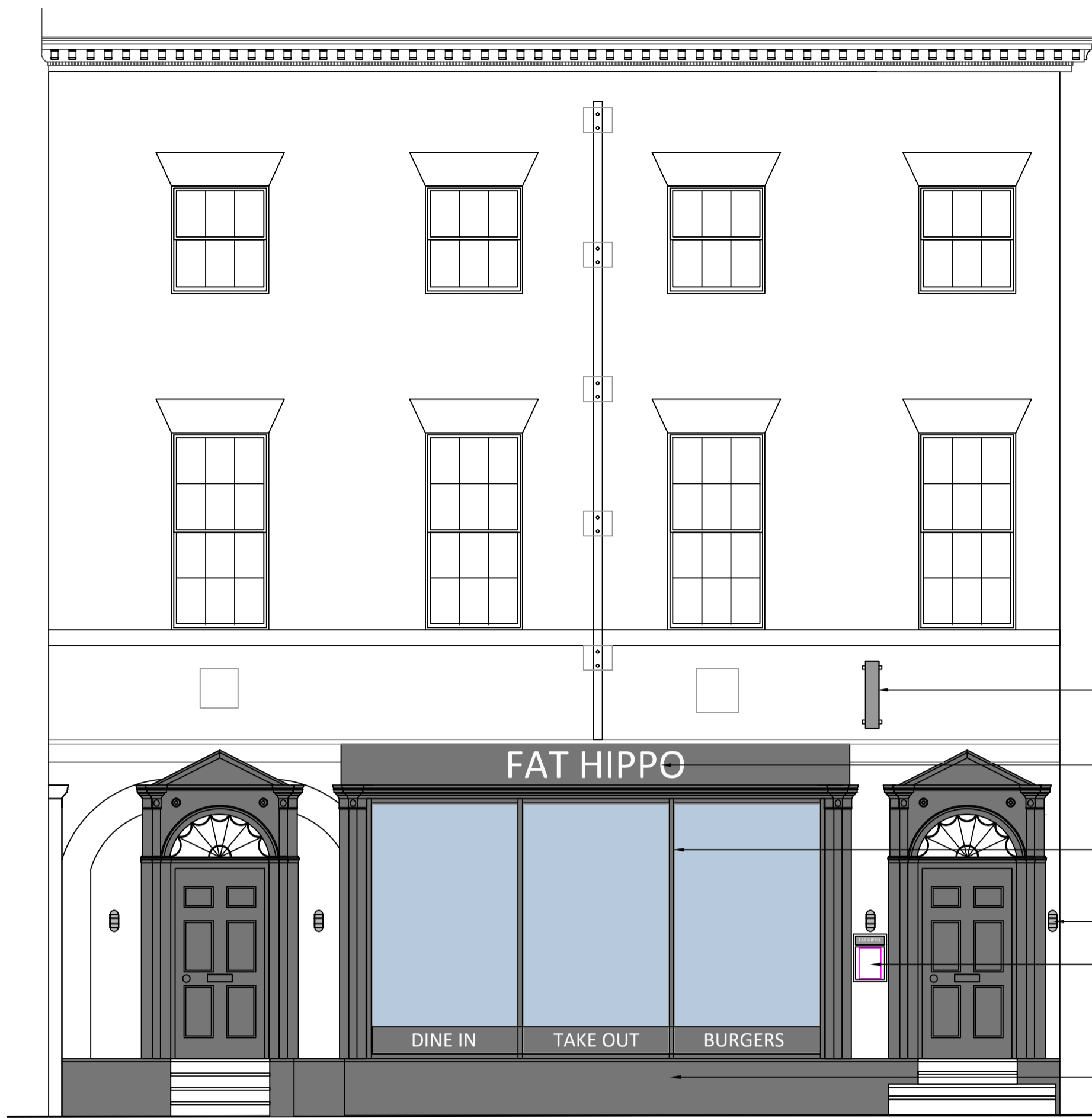
LOWER GROUND FLOOR PLAN