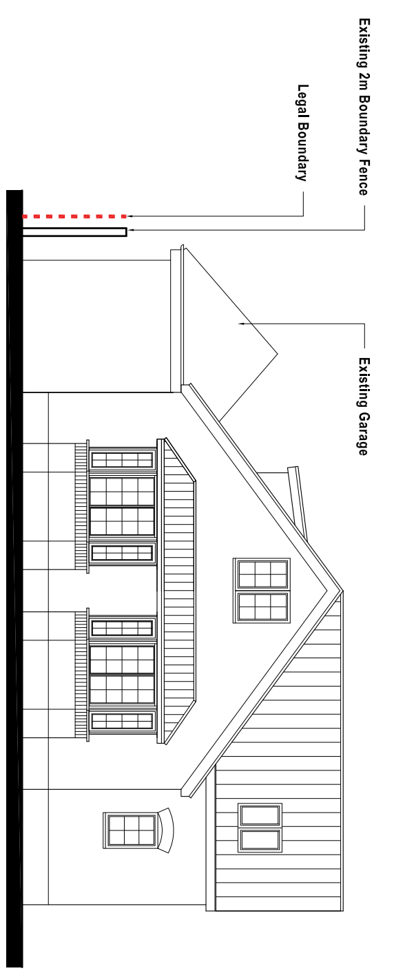
FRONT ELEVATION Scale - 1:100