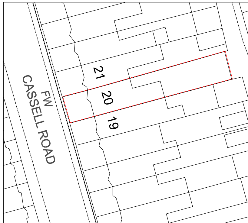
Existing Block Plan Scale: 1/500