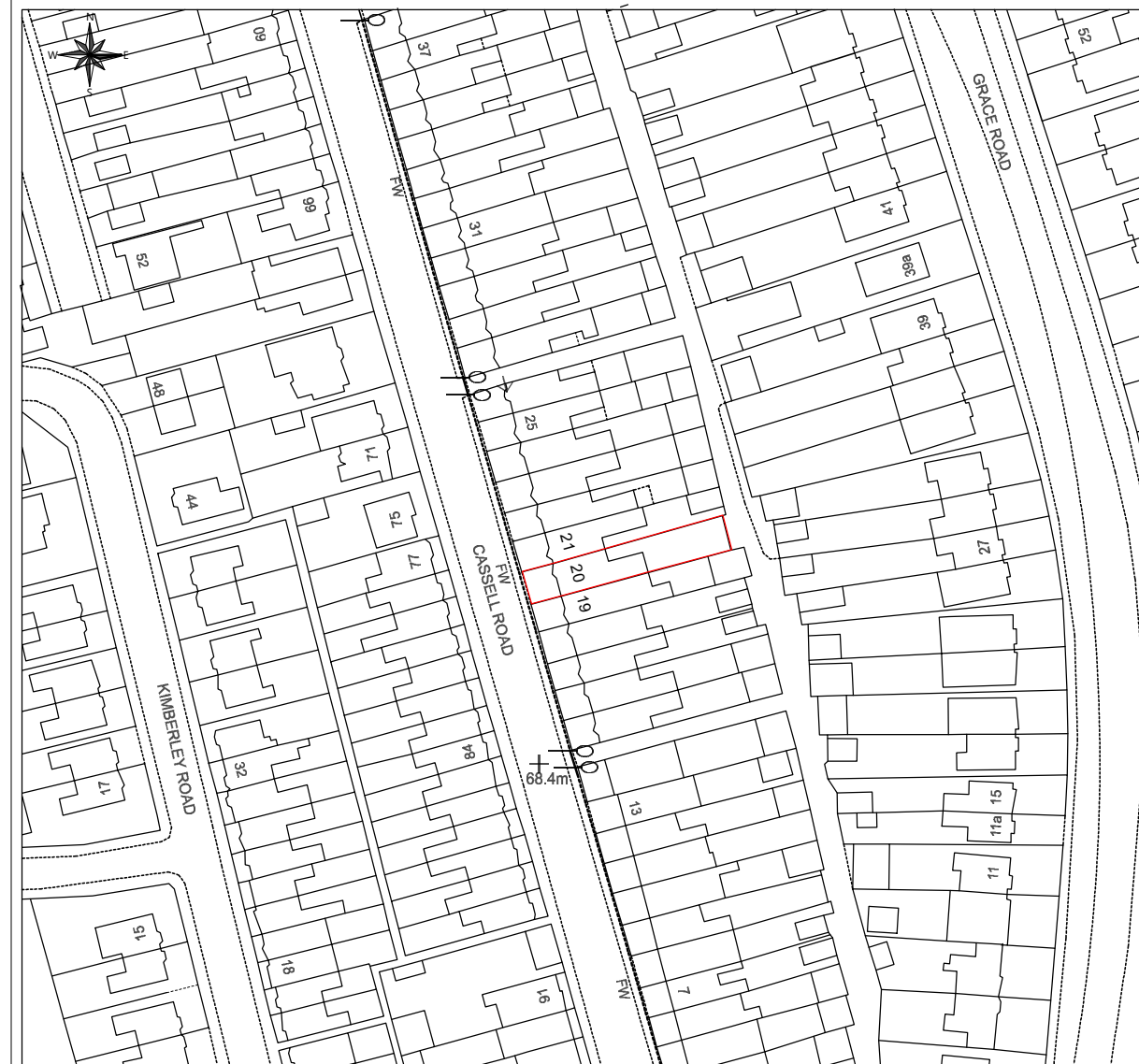
Existing Site Location Plan Scale: 1/1250