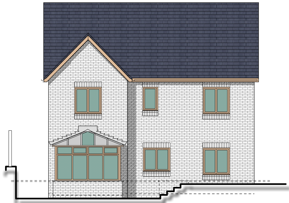
EXISTING REAR ELEVATION 1:100 @ A3