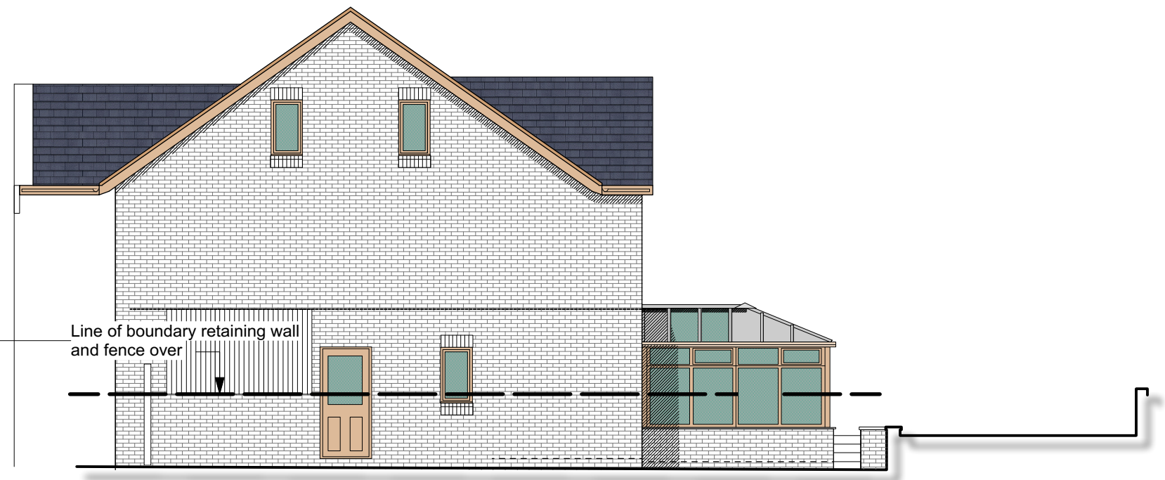
EXISTING PART WEST SIDE ELEVATION 1:100 @ A3