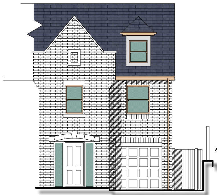
EXISTING PART FRONT ELEVATION 1:100 @ A3