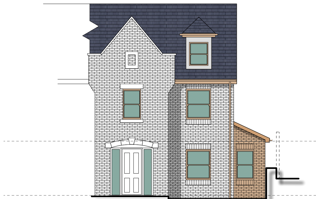
PROPOSED PART FRONT ELEVATION 1:100 @ A3