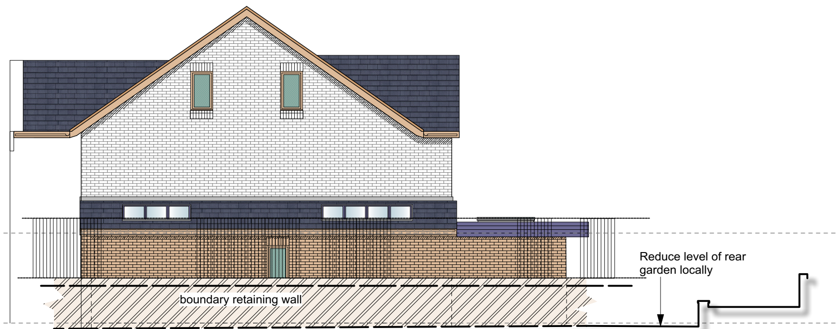
PROPOSED PART WEST SIDE ELEVATION 1:100 @ A3