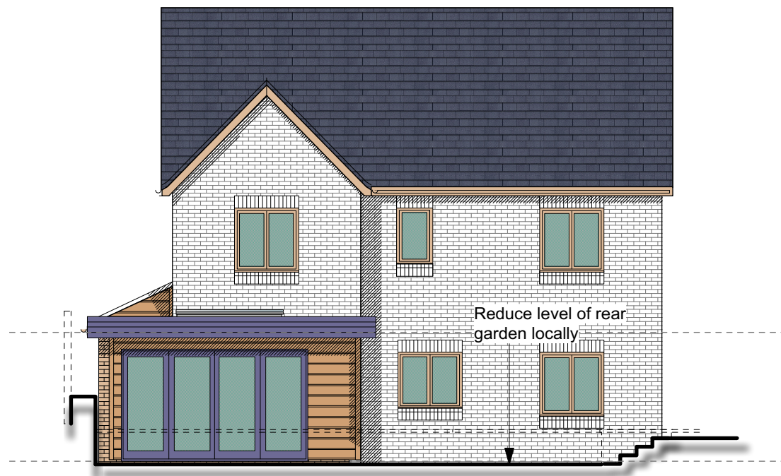
PROPOSED REAR ELEVATION 1:100 @ A3