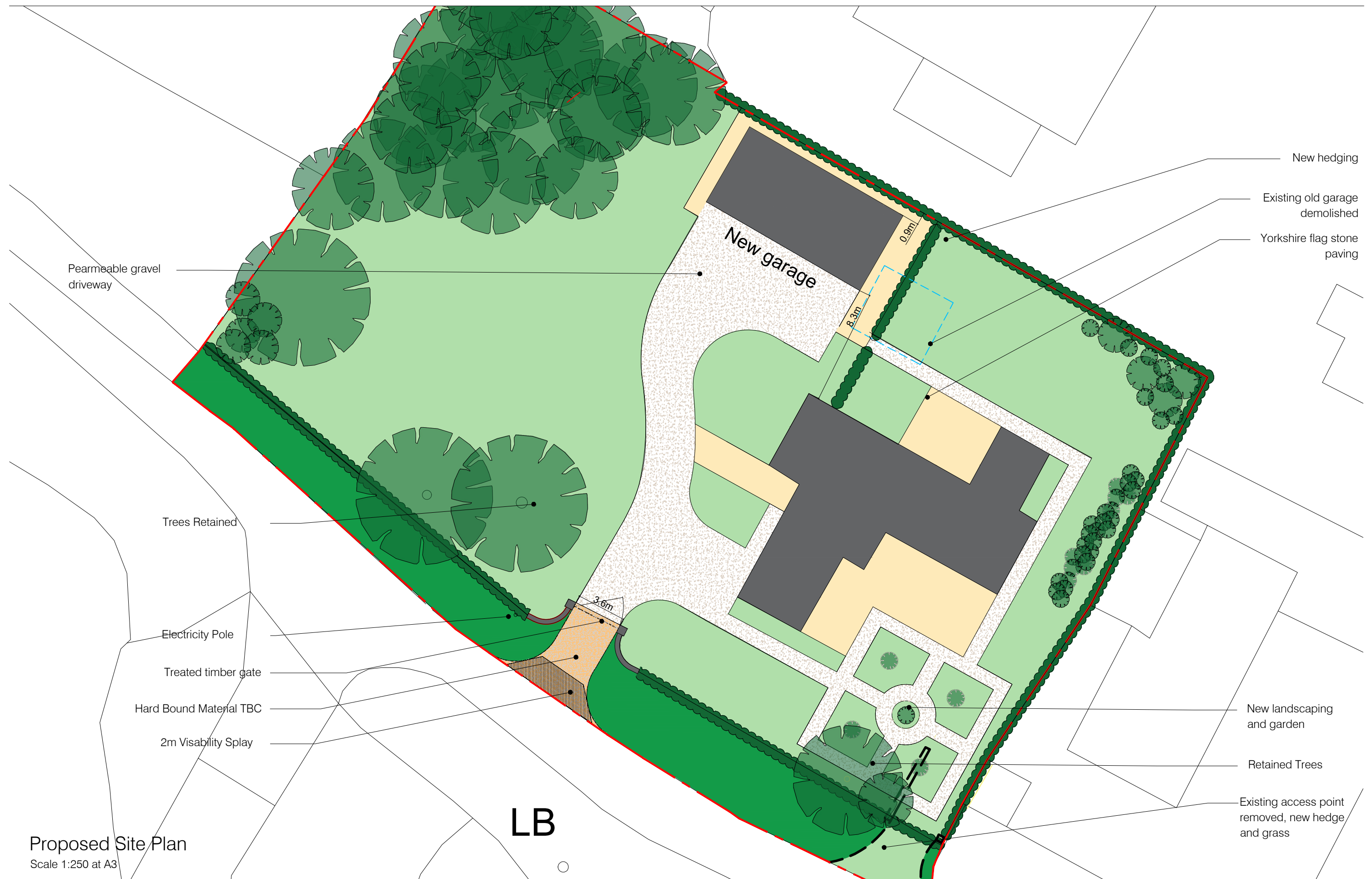
Proposed Site Plan Scale 1:250 at A3

Use figured dimensions only. All dimensions to be verified on site prior to commencing construction.