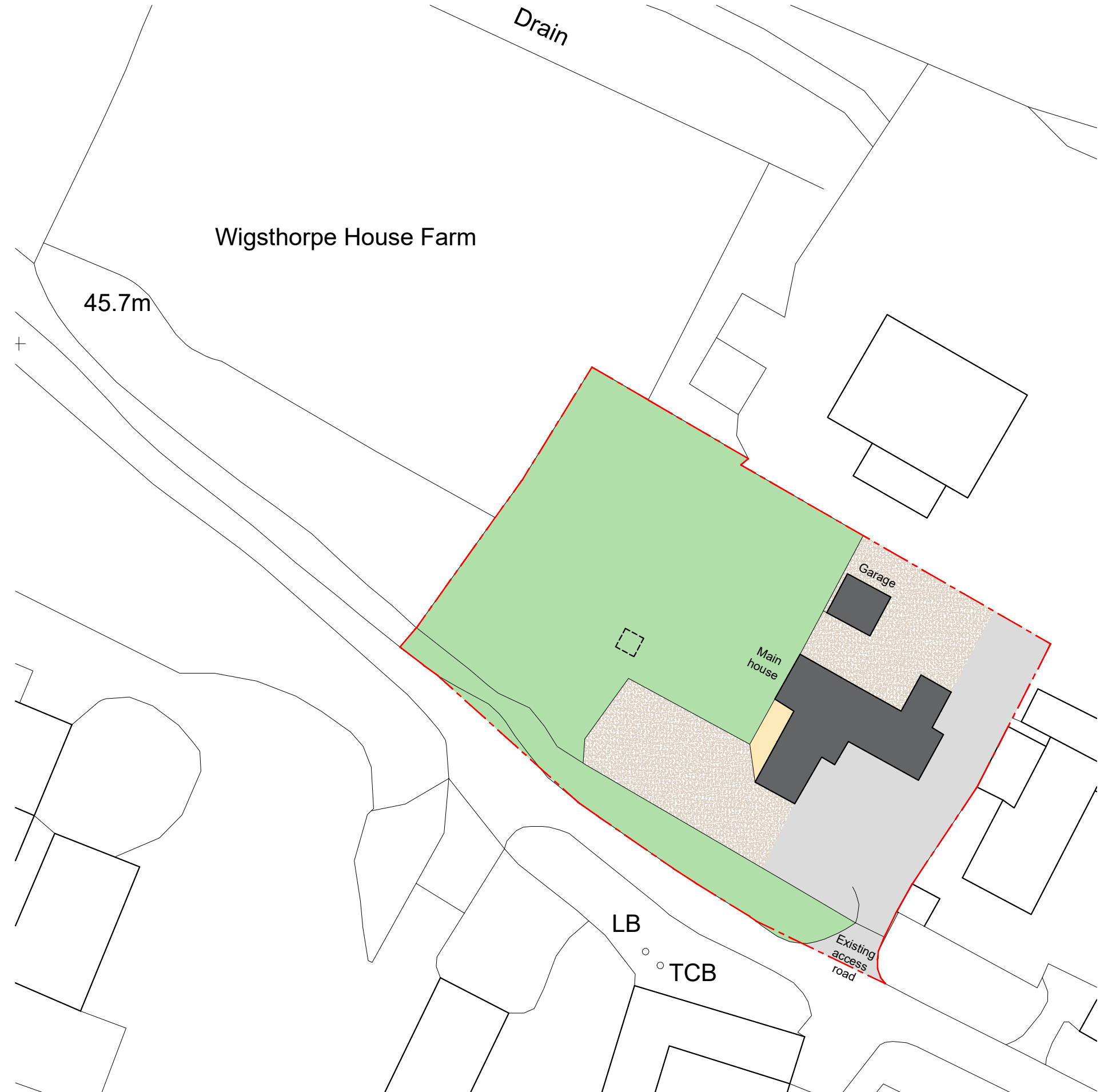
Existing Site Plan Scale 1:500 at A3