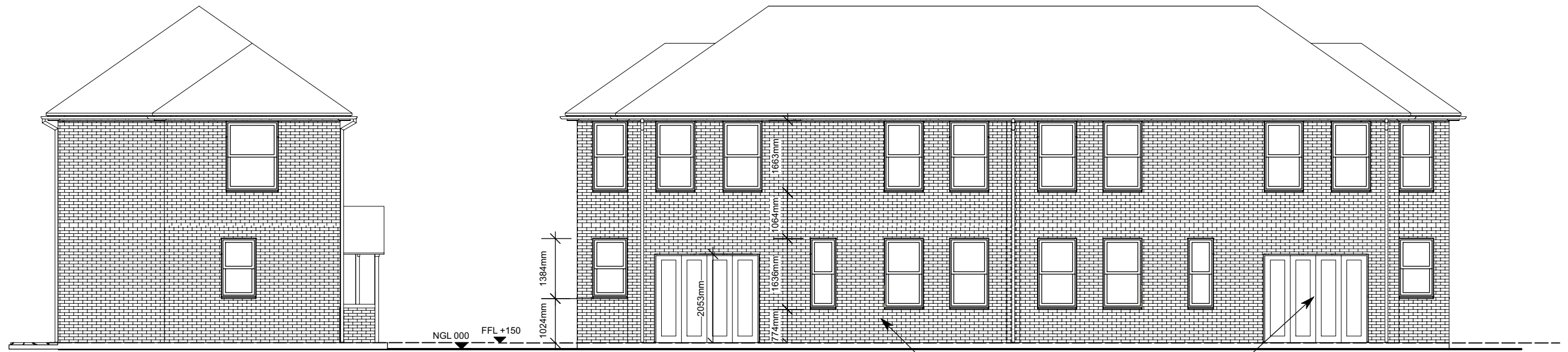
3 South Elevation Scale: 1:100