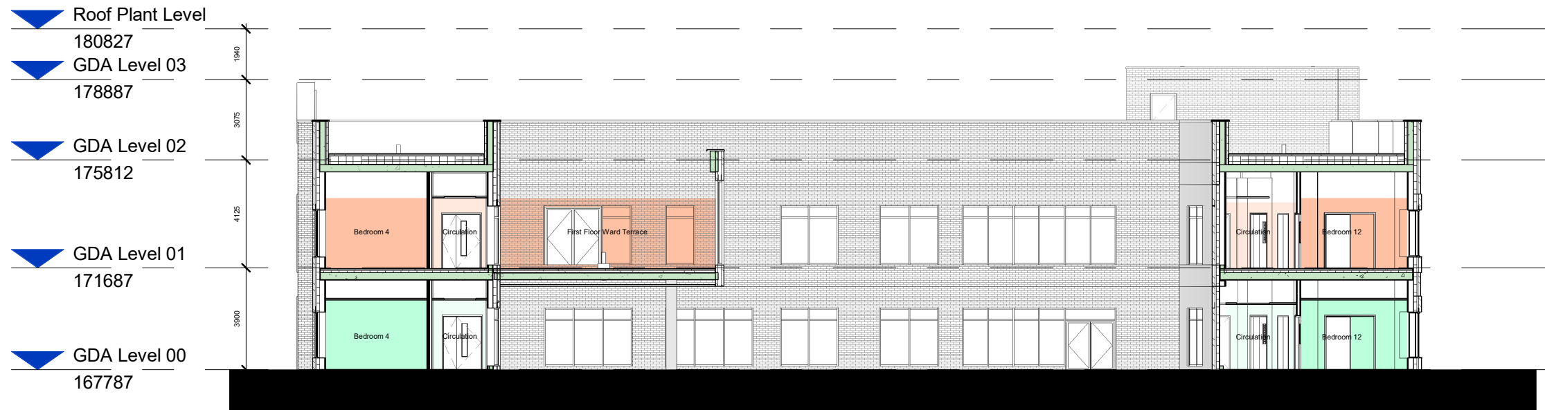
Long Section through Internal Courtyard Garden