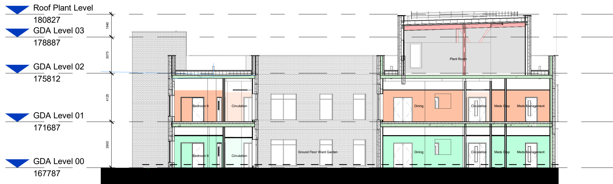
Short Section through Internal Courtyard Garden