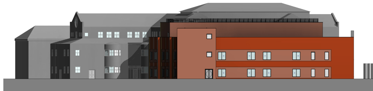
Side Elevation - Proposed