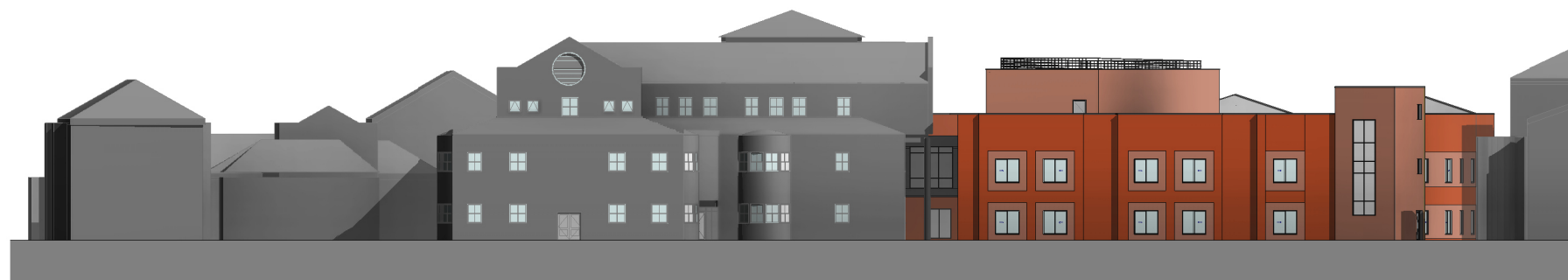
Garden Elevation - Proposed

THIS DRAWING (OR ANY PART THEREOF) MAY NOT BE COPIED, TRANSMITTED OR DISCLOSED TO ANY THIRD PARTY OR UNAUTHORISED PERSON WITHOUT THE PRIOR WRITTEN PERMISSION OF GILLING DOD ARCHITECTS.