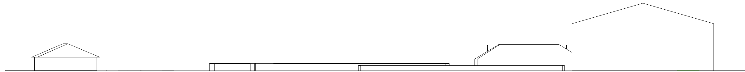
SOUTH ELEVATION SCALE 1:200