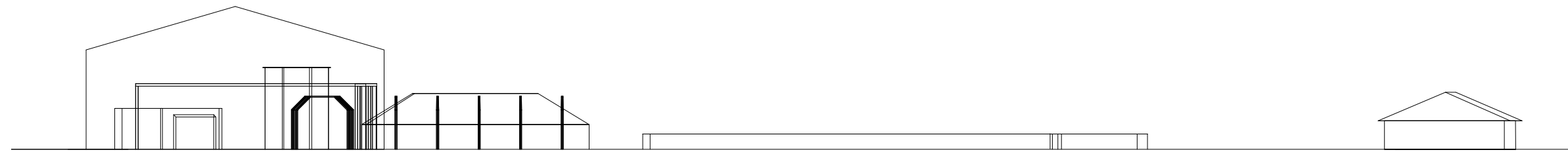
NORTH ELEVATION SCALE 1:200