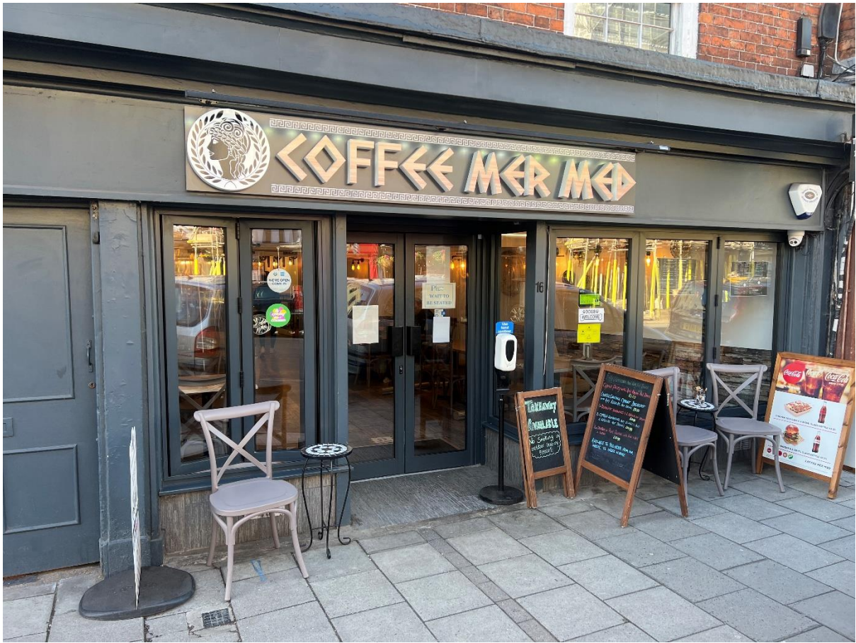
Shop Front to 16 High Street