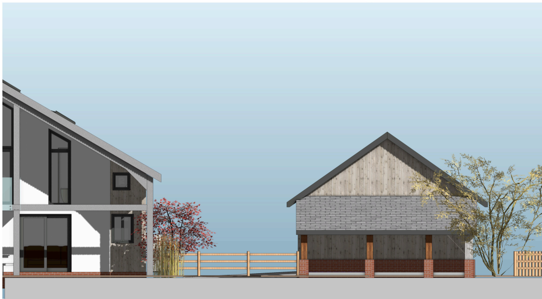
END ELEVATION (North)