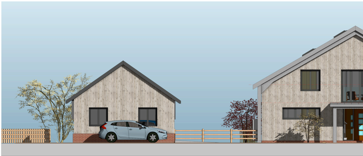
SIDE ELEVATION (South)