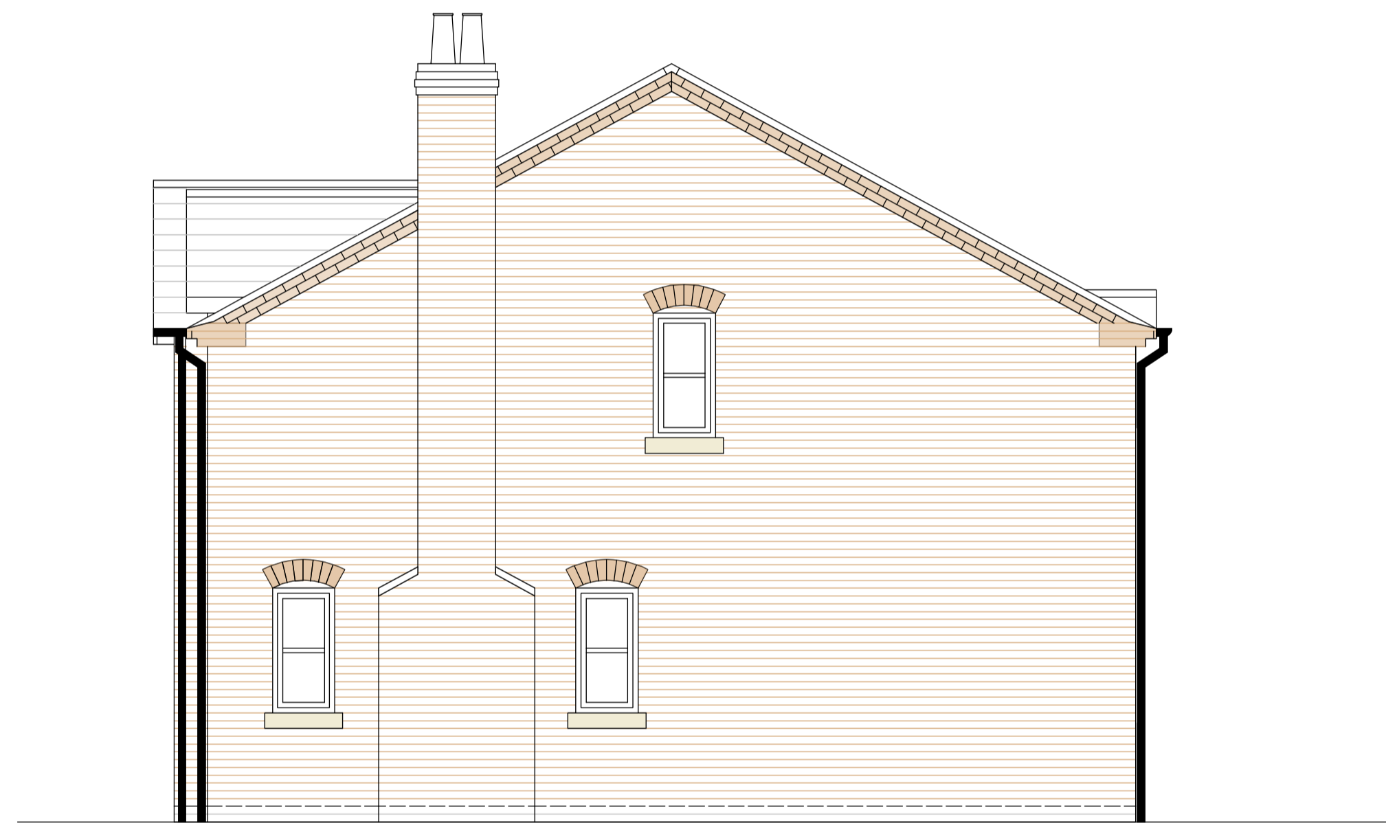
PROPOSED SIDE ELEVATION Scale 1:50

Area of Section 56.3sqm x width of Dwelling 13.0m Volume of Existing Dwelling = 731.9m 3 Proposed Extension to Dwelling 30% of Main Dwelling = 219.75 m 3 Proposed Extension Area of Section 38sqm x width of Extension 5.7m = 216.6m 3 Less than 30%