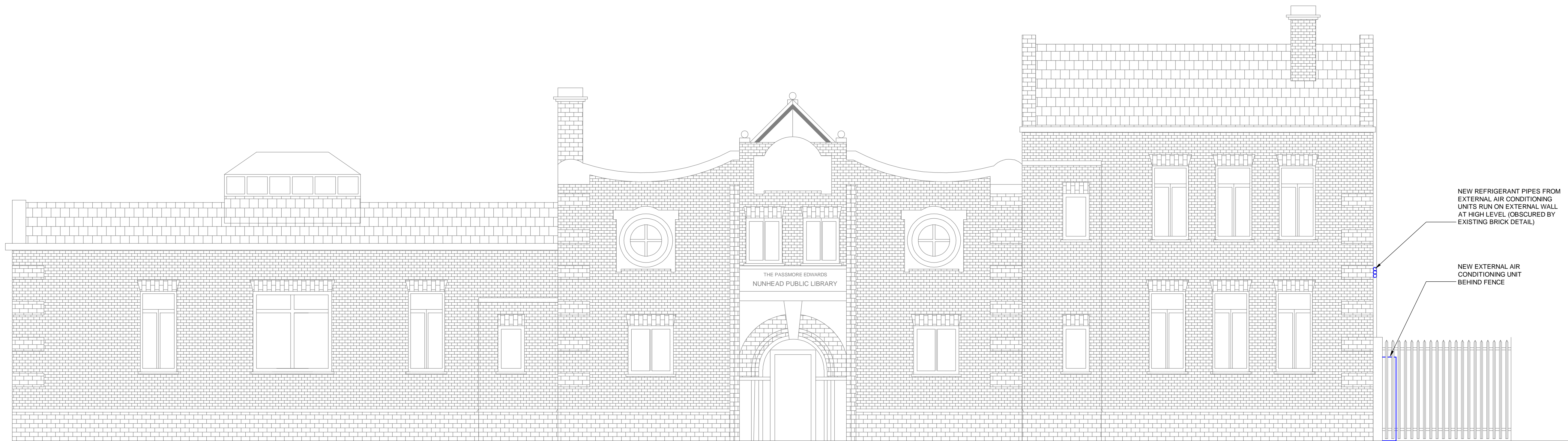
NORTH-EAST ELEVATION 1:50 @ A1