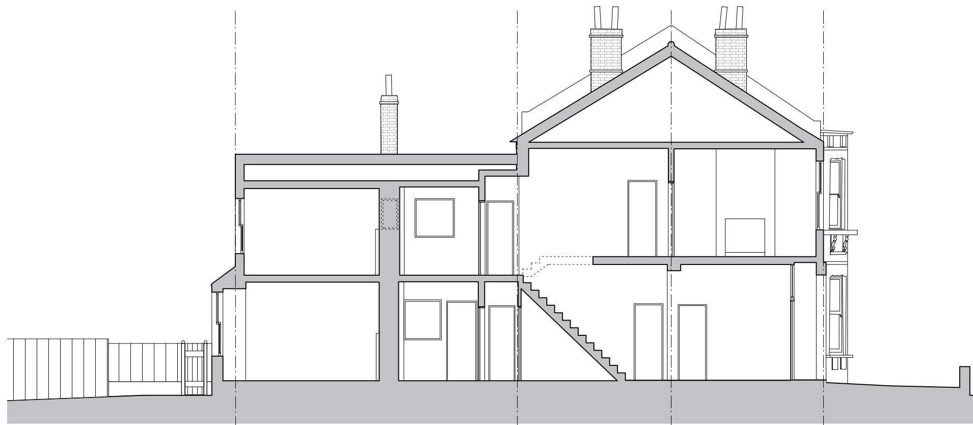
Existing Section AA