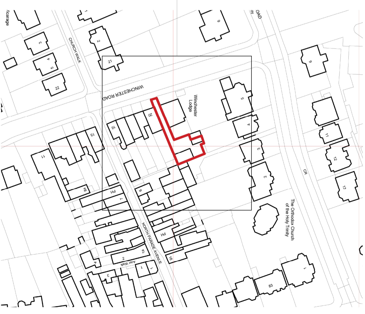
LOCATION PLAN (1:1250)