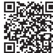
GOOGLE MAPS QR CODE

GOOGLE MAPS - https://tinyurl.com/3chdw7kx