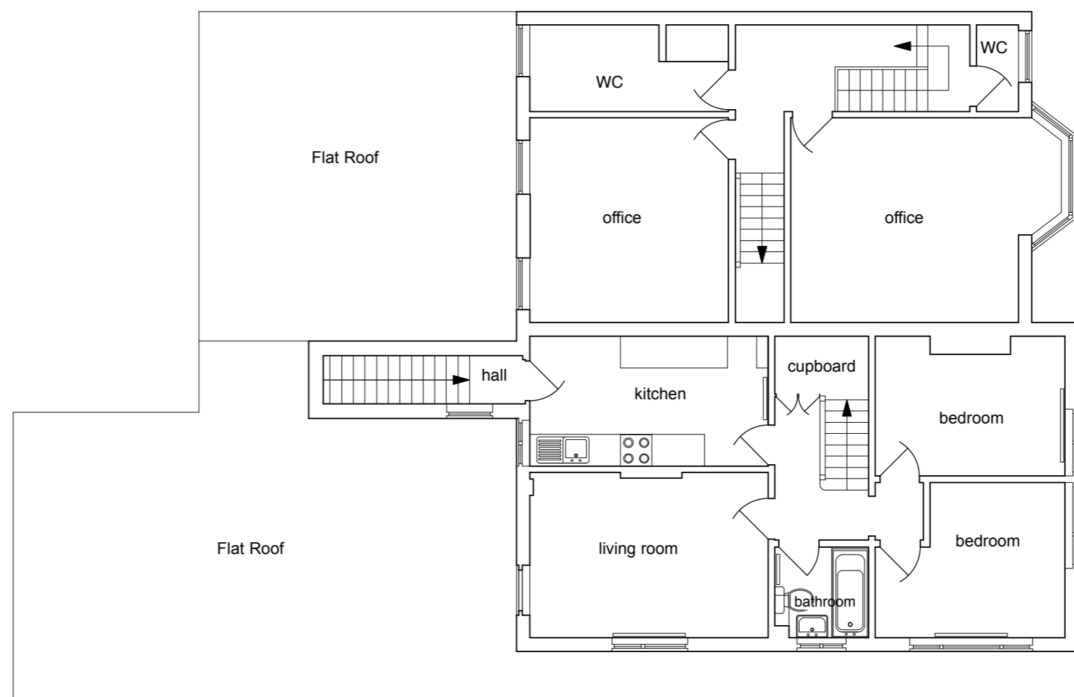
FIRST FLOOR PLAN GIA = 120m 2