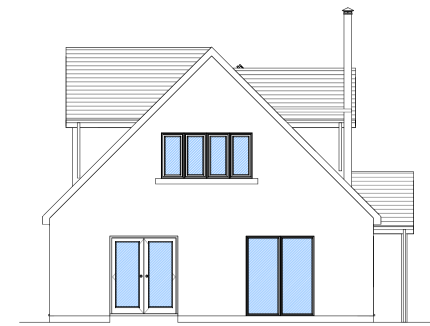
West Elevation 1 : 100

Materials List: Walls - Render on blockwork, off white in colour. Roof - Slate/Slate effect Windows - UPVC in White