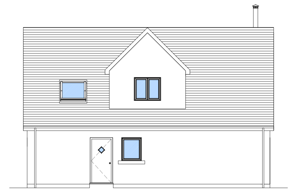
North Elevation 1 : 100