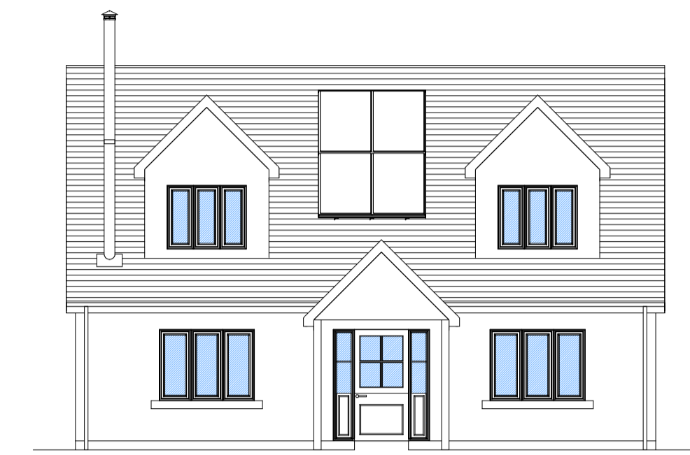
South Elevation 1 : 100