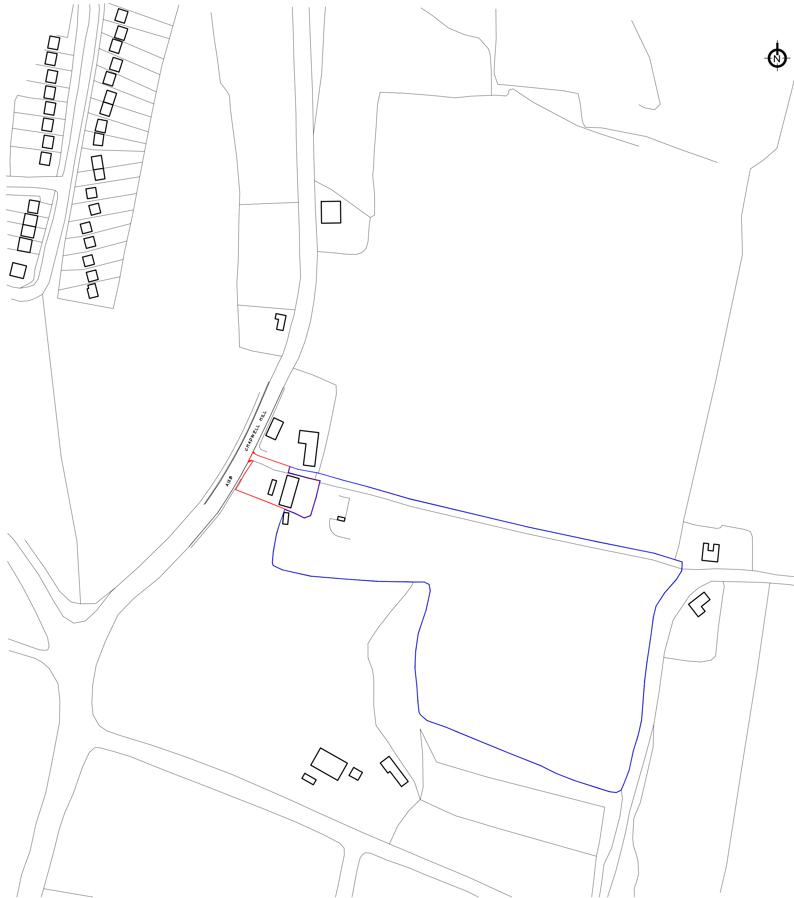
LOCATION PLAN (1:1250)