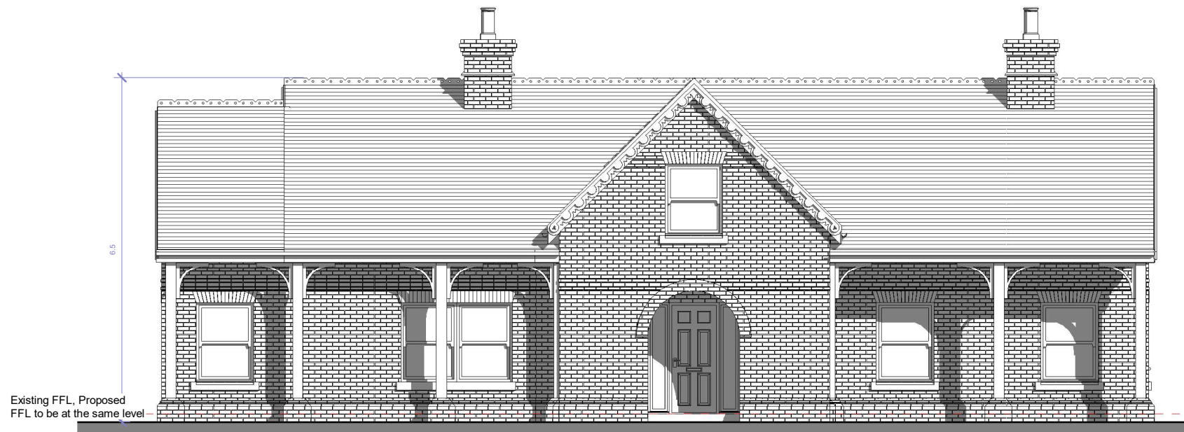
Proposed Front Elevation 1 : 100