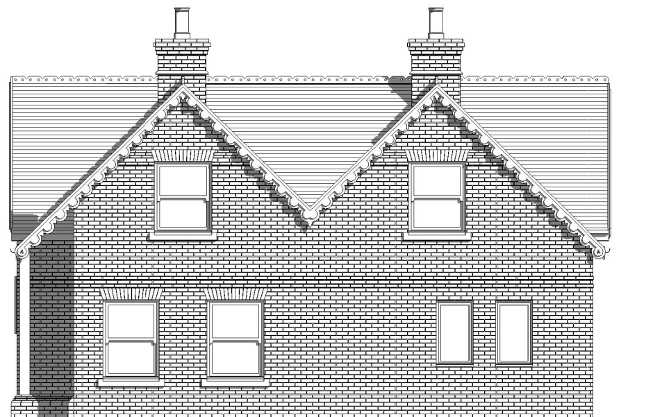
Proposed Side 2 Elevation 1 : 100